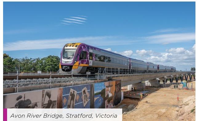
Avon River Bridge, Stratford, Victoria