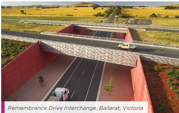
Remembrance Drive Interchange, Ballarat, Victoria

bigbuild.vic.gov.au/projects/regional-rail-revival/about/creative-program