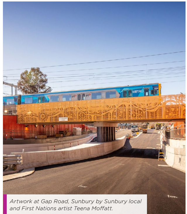
Artwork at Gap Road, Sunbury by Sunbury local and First Nations artist Teena Moffatt.

Some examples of art works created for rail projects around Victoria are shown below for inspiration.