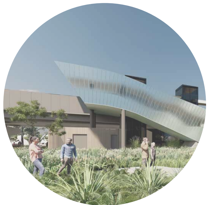
New Narre Warren Station entry looking south west. Artist impression, subject to change.

The station stairs reflect these Stories of Country. The distinct wave shape and reflective finish of the stairways represents the flow of water and people throughout the area, welcoming travellers as they pass through.