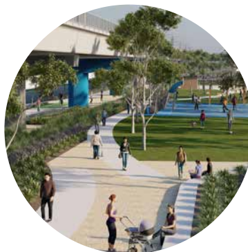
Open space corridor at the new Pakenham Station, looking west towards Main Street. Artist impression, subject to change.

By 2025, we'll remove the level crossing at Progress Street in Dandenong South, with a new road bridge connecting Progress Street and Fowler Road, and close the level crossing at Station Street, Officer.