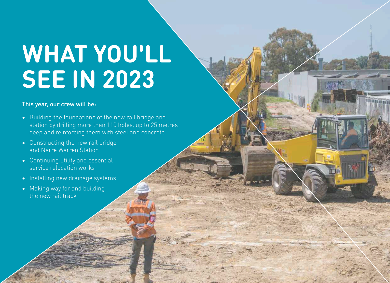
Major construction underway at Webb Street.