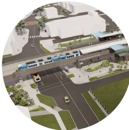
The new rail bridge over Webb Street looking north east. Artist impression, subject to change.

In the coming weeks, our crew will begin to build the concrete foundations of the bridge. We'll do this by drilling and reinforcing more than 110 holes deep into the ground. These reinforced holes, called piles , will support the new rail bridge and station.