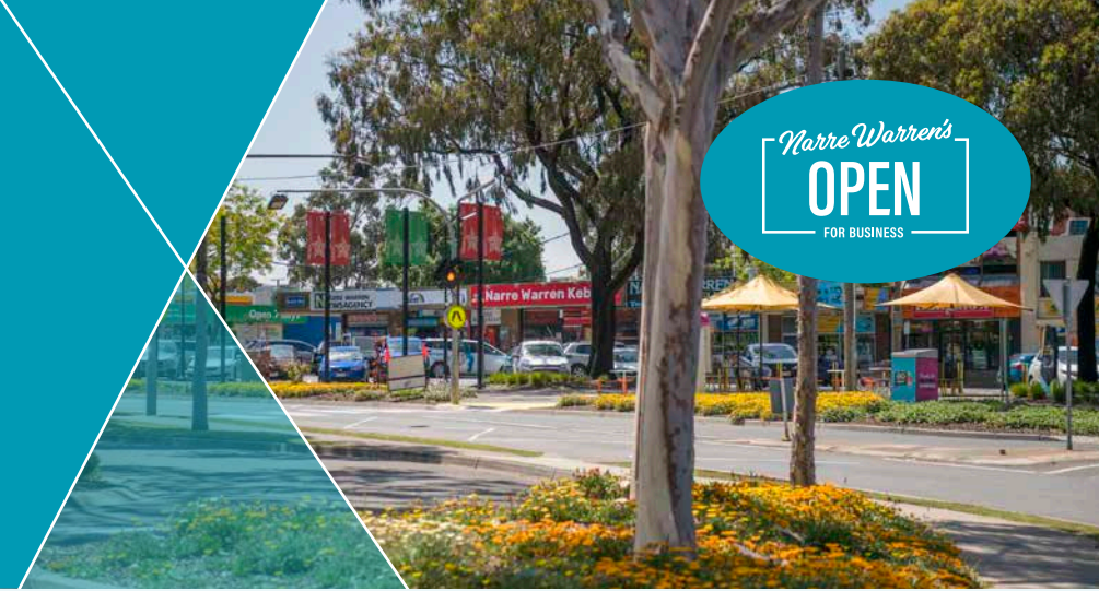
Narre Warren Village looking towards the east side of Webb Street.