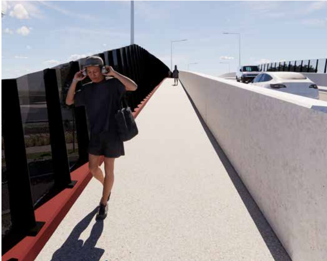
New pedestrian and shared use paths over the bridge. Artist impression only, subject to change.