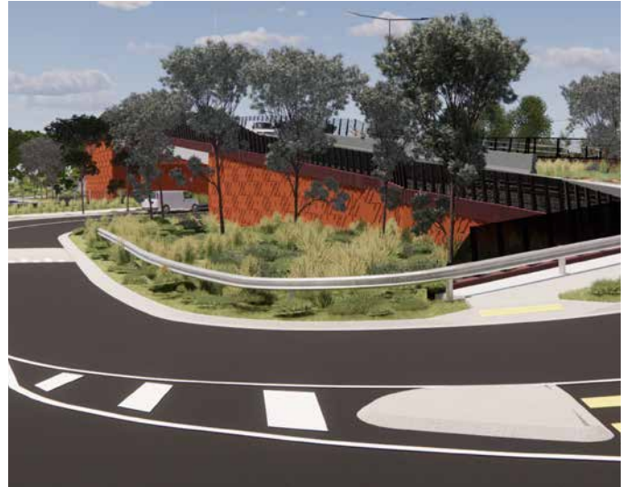
Fairfield Street will pass under the new road bridge and connect to Camms Road and Murray Court via a roundabout. Artist impression only, subject to change.