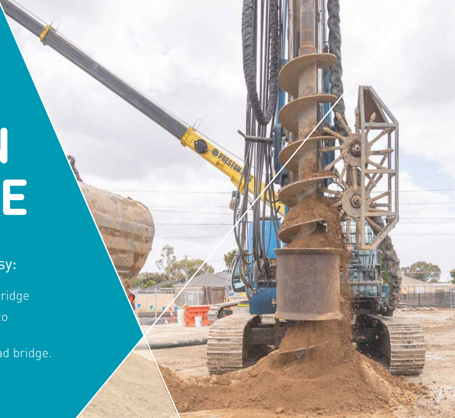
Piling rig drilling into the ground.