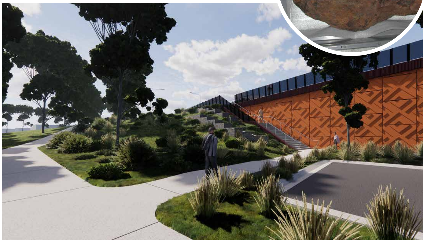
Textured pattern on the walls of the new road bridge. Artist impression only, subject to change.