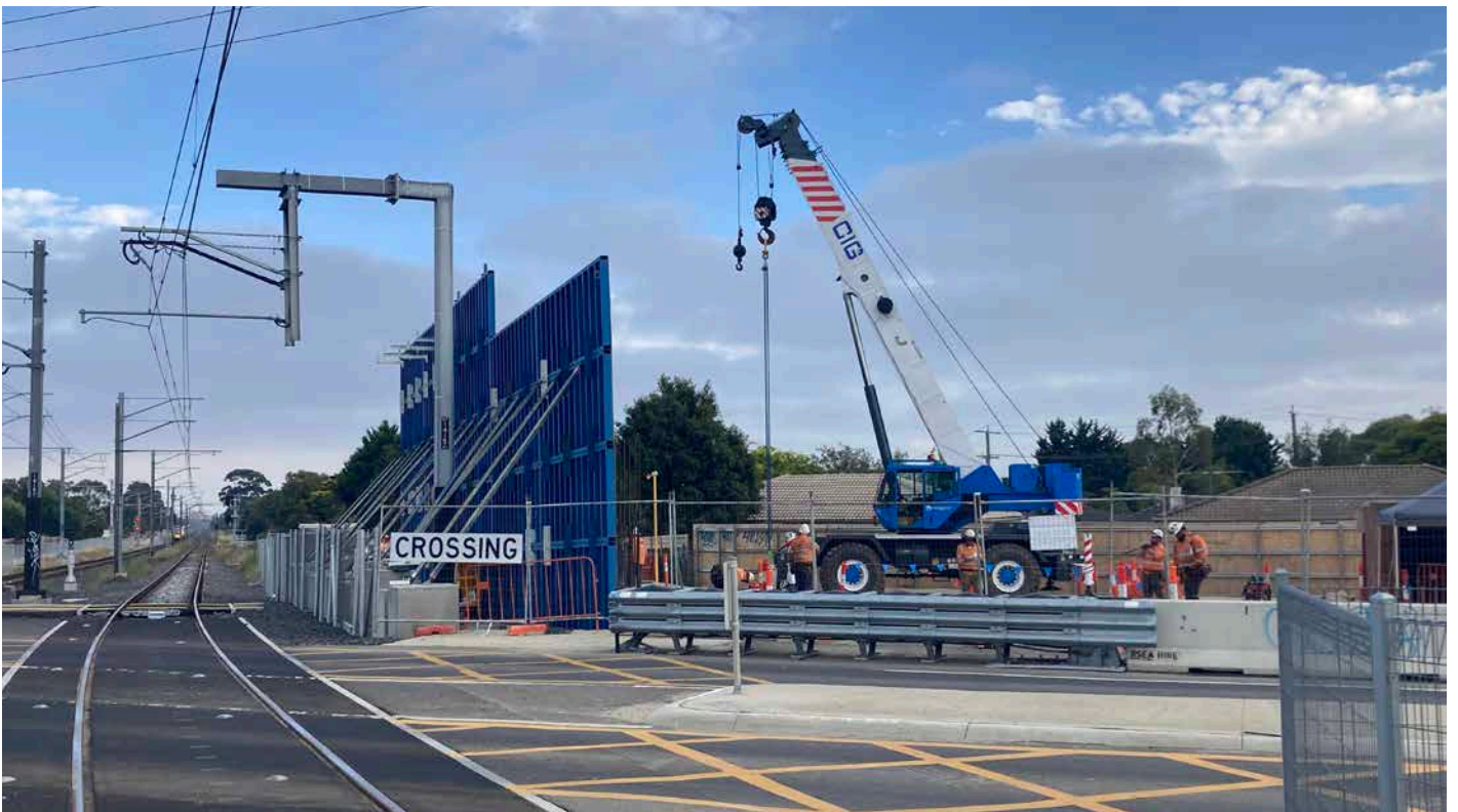
Abutment wall being constructed near the level crossing. Over the coming months the walls will be completed.

Service relocation works will also continue throughout the project area. This will include removing the overhead power lines to make way for the new road bridge.