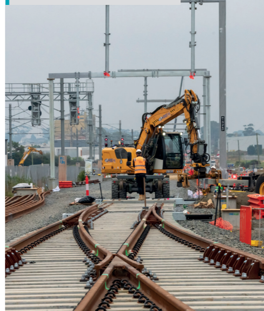
Track works at East Pakenham.

We have completed piling and excavation for the pedestrian underpass at East Pakenham Station. We will continue to work on the underpass with installation of barriers, panelling, ramps, and stairs as well as landscaping still to be finalised.