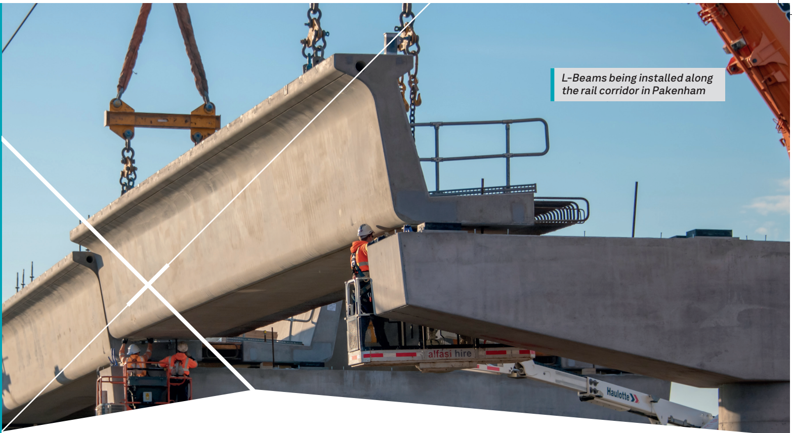
L-Beams being installed along the rail corridor in Pakenham