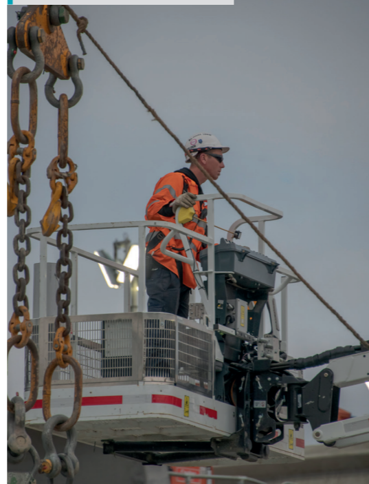
Workers install L-Beams on McGregor Road in Pakenham

During our 24/7 works along the rail corridor, there will be road closures at Racecourse Road, McGregor Road and Main Street.