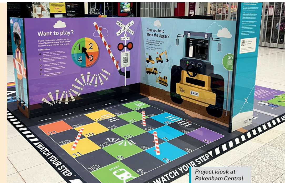
Project kiosk at Pakenham Central.

Make sure you check it out next time you are shopping at Pakenham Central. The kiosk is located outside Woolworths.