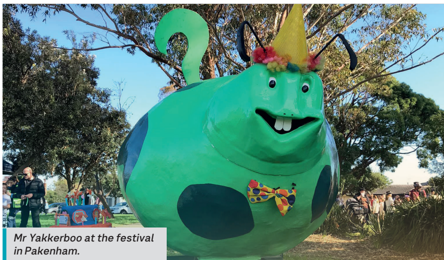
Mr Yakkerboo at the festival in Pakenham.

Thank you for coming to the festival, helping us celebrate Mr Yakkerboo and learning more about the Big Build projects.