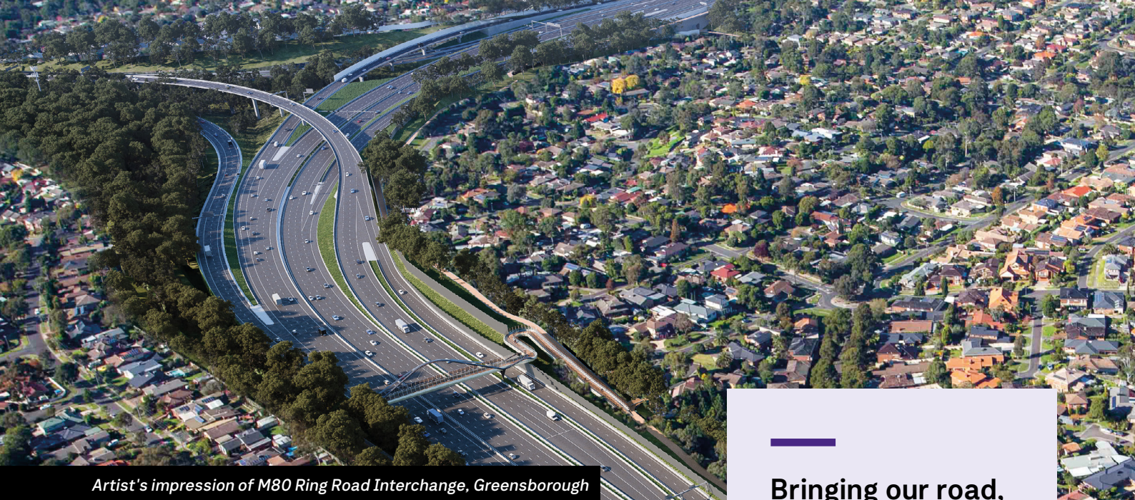
Artist's impression of M80 Ring Road Interchange, Greensborough