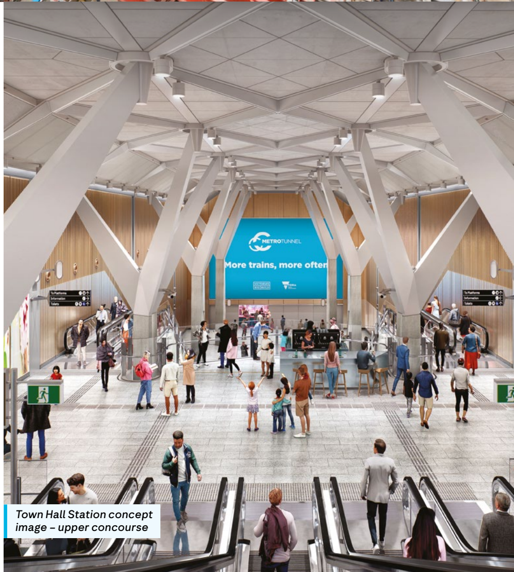
Town Hall Station concept image – upper concourse

Town Hall Station will have Victorian-first platform screen doors for better safety, climate control and less noise.