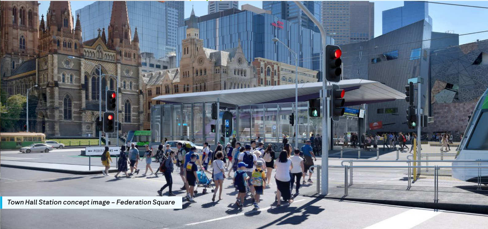
Town Hall Station concept image – Federation Square

We've installed lifts from the Degraves Street subway to platforms 1 to 10 at Flinders Street Station, to make the CBD's oldest train station more accessible and help people move from Metro Tunnel to City Loop services easily.