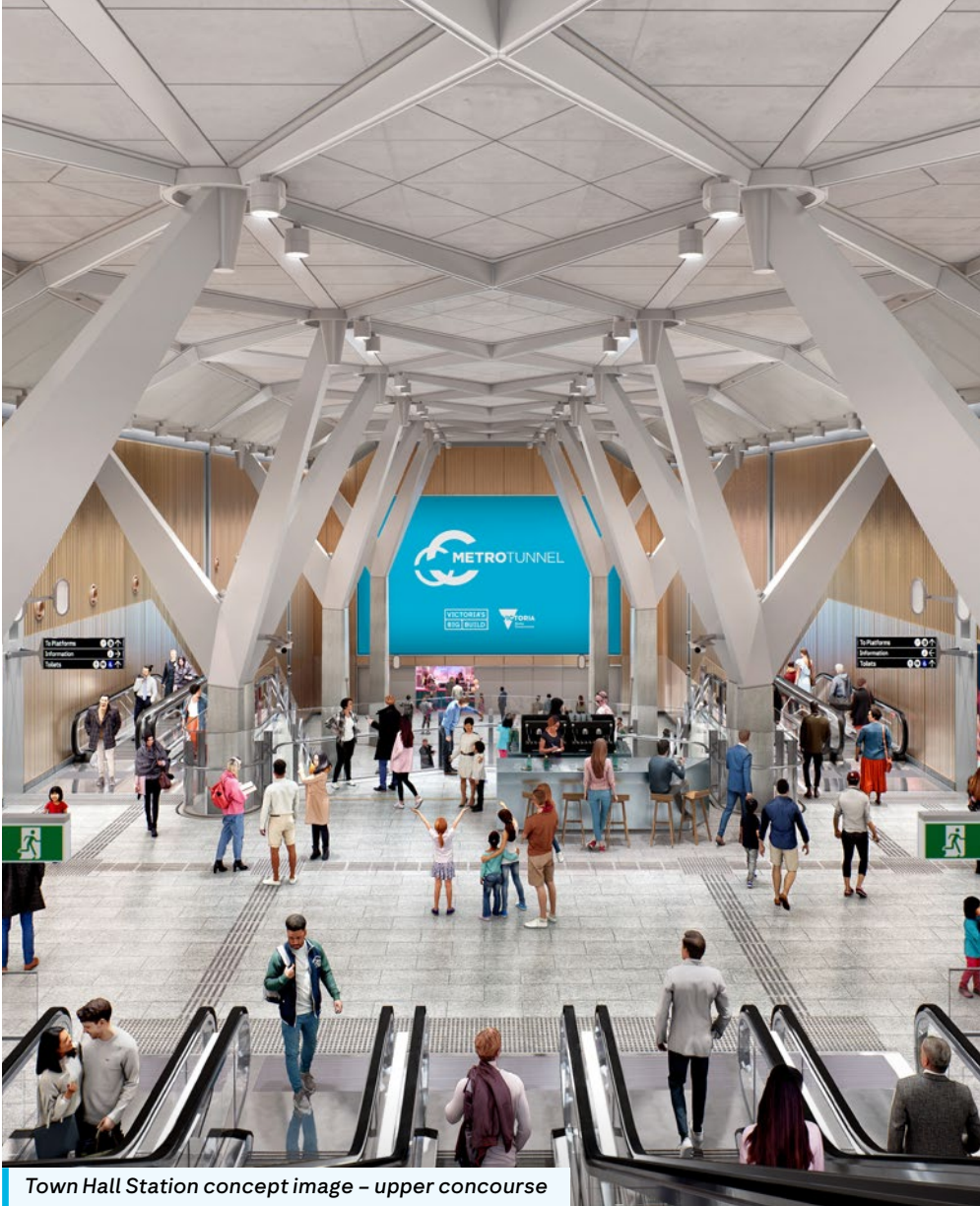
Town Hall Station concept image – upper concourse

Town Hall Station will have Victorian-first platform screen doors for better safety, climate control and less noise.