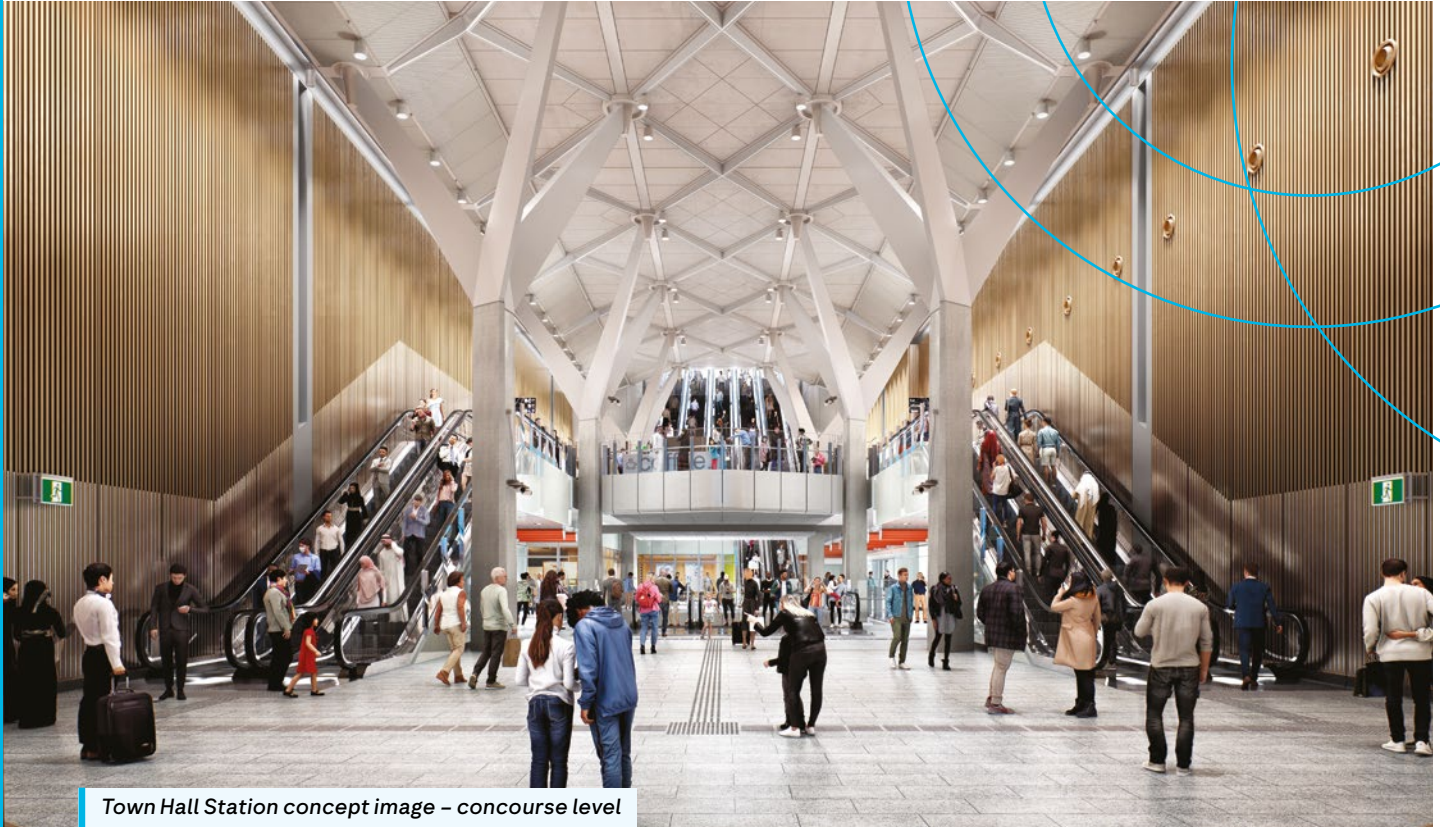
Town Hall Station concept image – concourse level

The Metro Tunnel will run the busy Cranbourne, Pakenham and Sunbury lines through a new tunnel under Melbourne's CBD, with bigger and more modern trains and next generation signalling for turn up and go services.