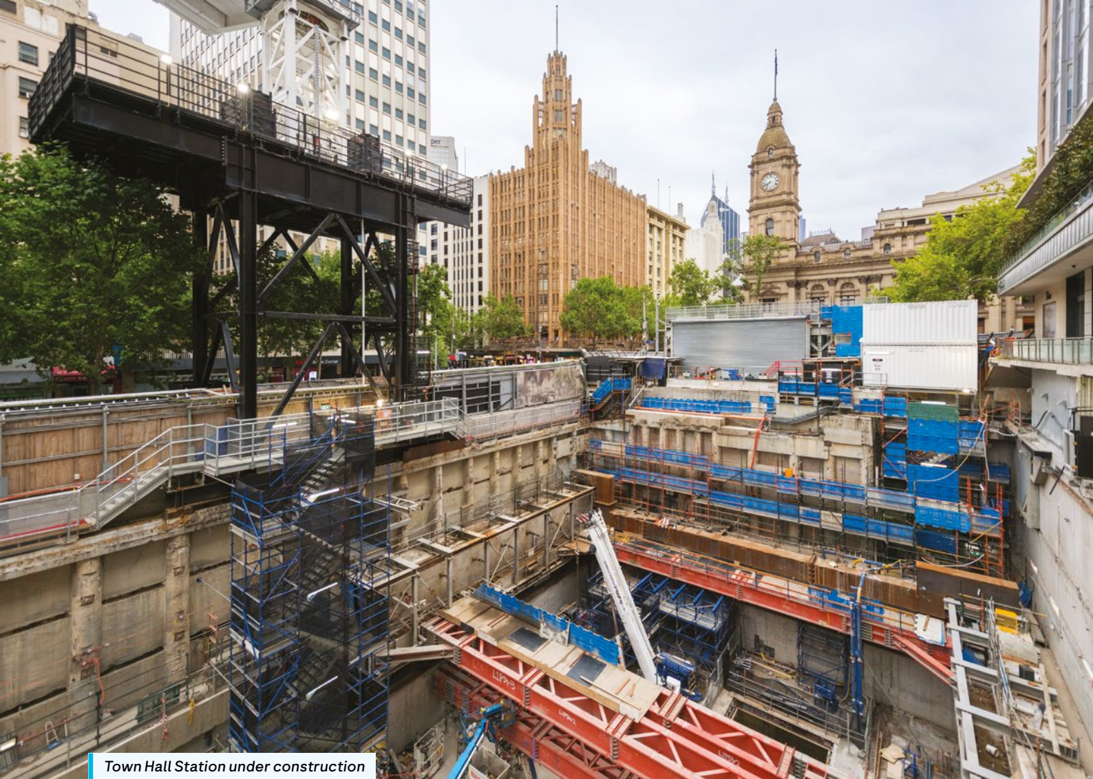
Town Hall Station under construction