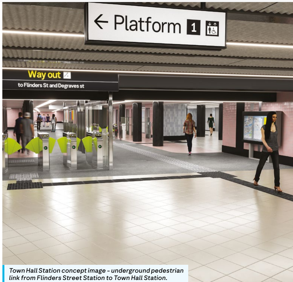
Town Hall Station concept image - underground pedestrian link from Flinders Street Station to Town Hall Station.

Next-generation High Capacity Signalling for turn up and go services