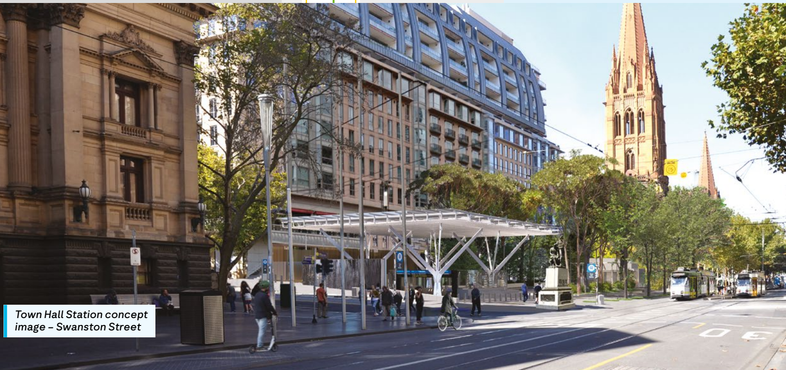
Town Hall Station concept image - Swanston Street

We're also installing lifts from the Degraves Street subway to platforms 1 to 10 at Flinders Street, to make the CBD's oldest train station more accessible and help people move from Metro Tunnel to City Loop services easily.