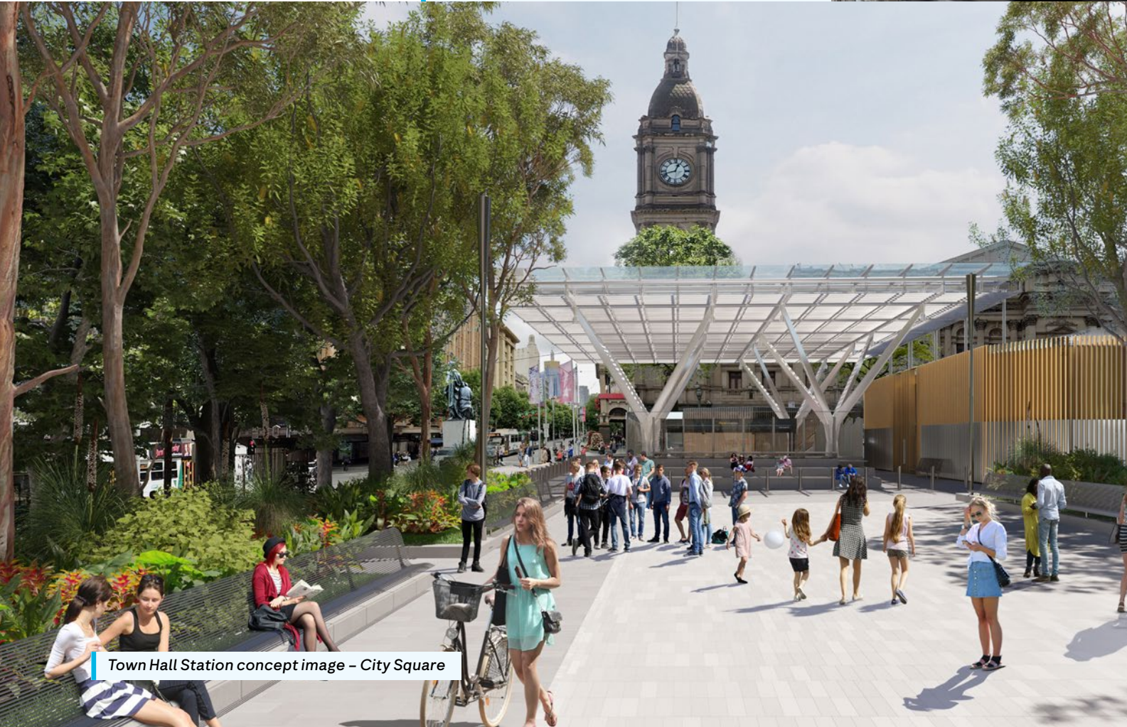
Town Hall Station concept image – City Square