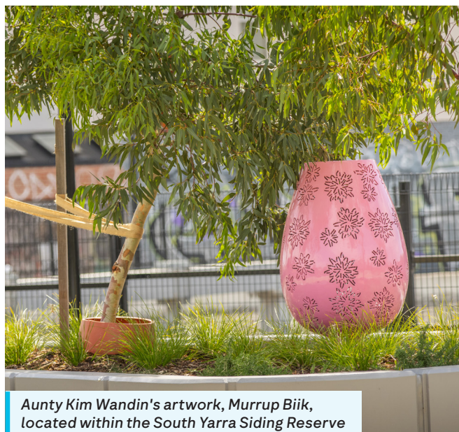
Aunty Kim Wandin's artwork, Murrup Biik, located within the South Yarra Siding Reserve

24 hour works are sometimes required during peak construction activities