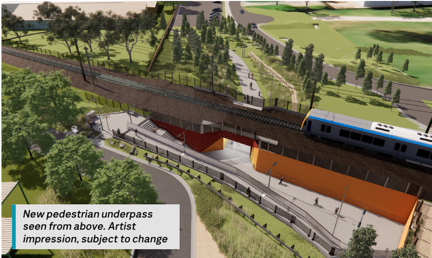
New pedestrian underpass seen from above. Artist impression, subject to change

To view the disruptions in your area scan the QR code or visit bigbuild.vic.gov.au/disruptions