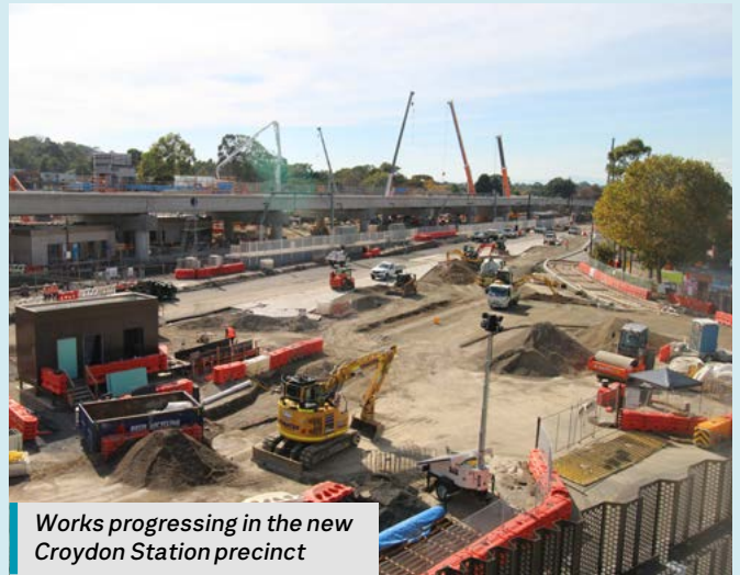
Works progressing in the new Croydon Station precinct