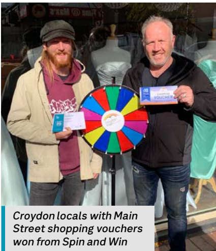
Croydon locals with Main Street shopping vouchers won from Spin and Win

Make sure to sign up to SMS updates by texting 'Coolstore' to 0438 942 094 to find out where the next Spin and Win will take place.