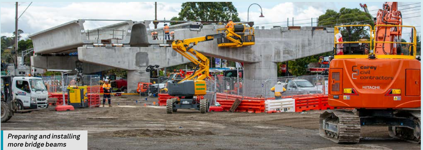
Preparing and installing more bridge beams