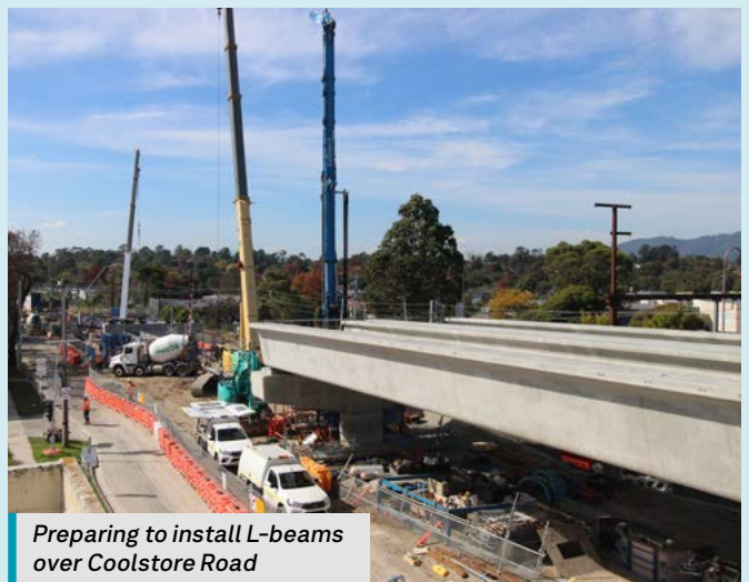
Preparing to install L-beams over Coolstore Road