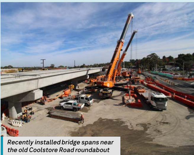
Recently installed bridge spans near the old Coolstore Road roundabout