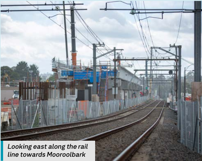
Looking east along the rail line towards Mooroolbark

See how works are progressing in Croydon.