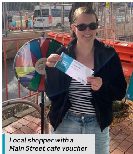
Local shopper with a Main Street cafe voucher

Thank you for supporting local businesses while we work in Croydon.