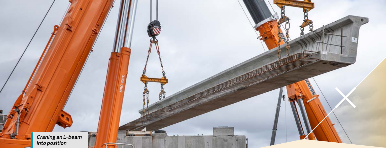
Craning an L-beam into position