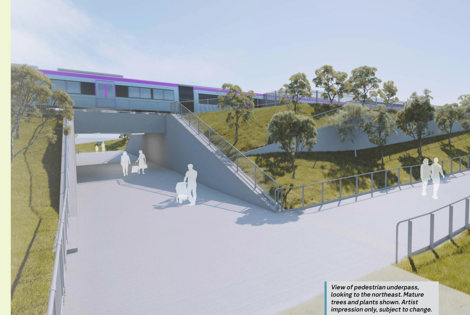
View of pedestrian underpass, looking to the northeast. Mature trees and plants shown. Artist impression only, subject to change.