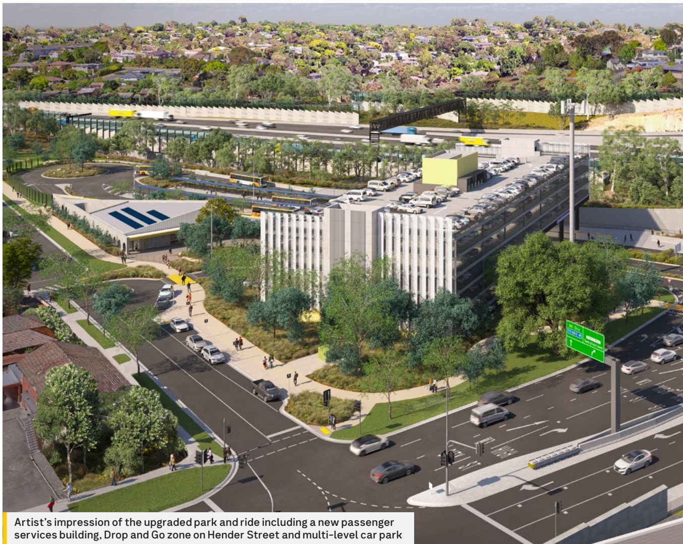
Artist's impression of the upgraded park and ride including a new passenger services building, Drop and Go zone on Hender Street and multi-level car park

We're upgrading Doncaster Park and Ride and connecting it to Melbourne's first dedicated busway to reduce travel times and improve public transport in Melbourne's east.