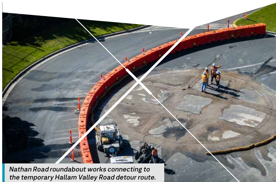
Nathan Road roundabout works connecting to the temporary Hallam Valley Road detour route.