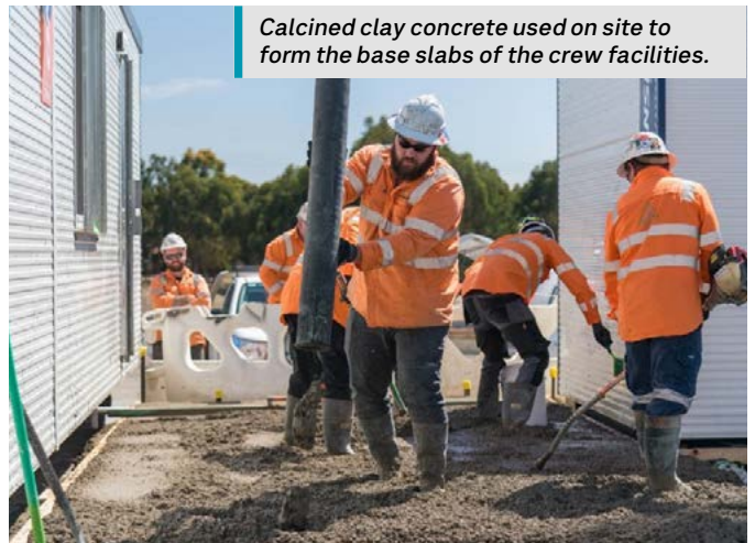
Calcined clay concrete used on site to form the base slabs of the crew facilities.

The synthetic bars are used to support sections of the bridge's retaining walls, made up of 450 concrete panels.