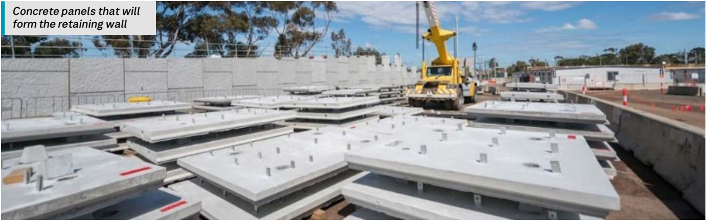
Concrete panels that will form the retaining wall