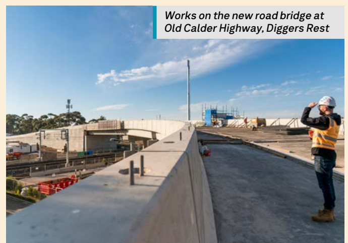
Works on the new road bridge at Old Calder Highway, Diggers Rest