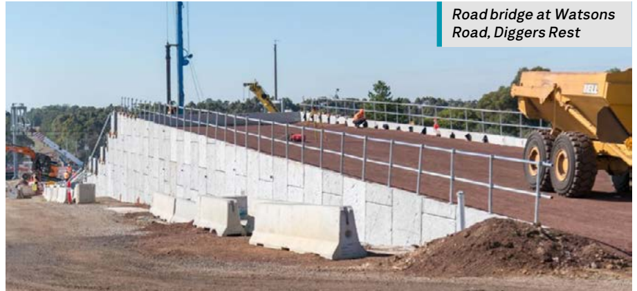
Road bridge at Watsons Road, Diggers Rest