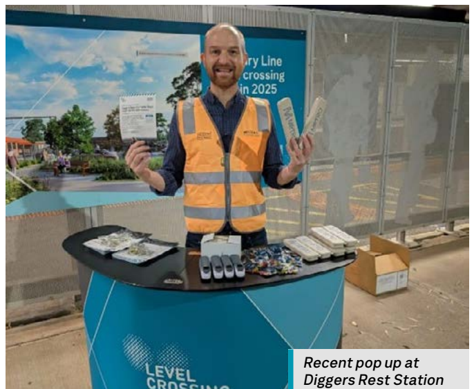
Recent pop up at Diggers Rest Station

We'll be out and about in the coming weeks so keep an eye out for us.