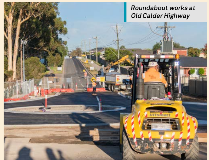
Roundabout works at Old Calder Highway

The bridge will take traffic over the rail line south of Stan Payne Reserve, before turning north and connecting to Diggers Rest-Coimadai Road. It includes a raised cycling path to separate vehicles and cyclists.