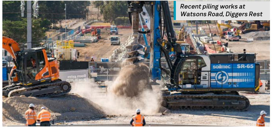
Recent piling works at Watsons Road, Diggers Rest

The new bridge will include separated pedestrian access to enable connectivity across the rail corridor for future developments north of Diggers Rest.