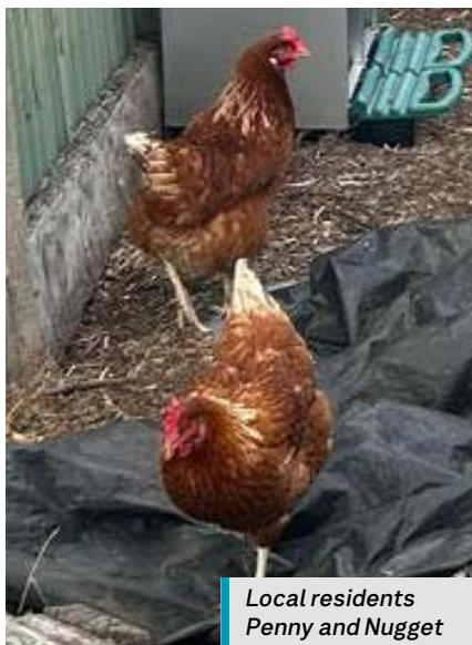
Local residents Penny and Nugget

Over March and April our team visited Penny and Nugget each day to check on them and let them out of their hutch while their owners were relocated during a period of busy works in Diggers Rest.