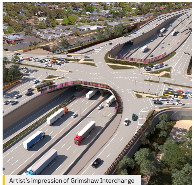
Artist's impression of Grimshaw Interchange

Grimshaw Street will be closed between Greensborough Bypass and Frye Street, for five weeks, with 24 hour works on Grimshaw Street and in Trist Reserve.