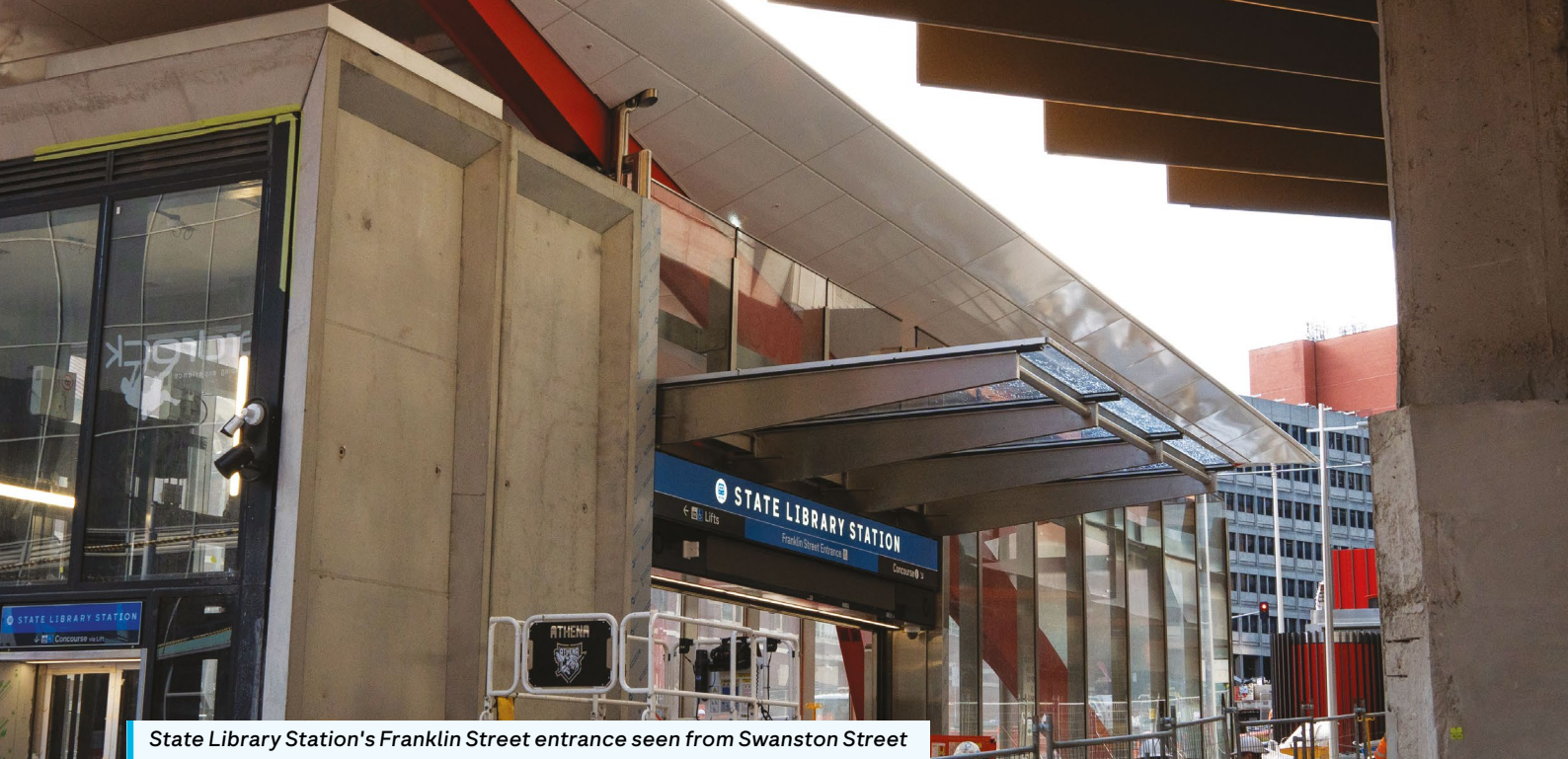
State Library Station's Franklin Street entrance seen from Swanston Street