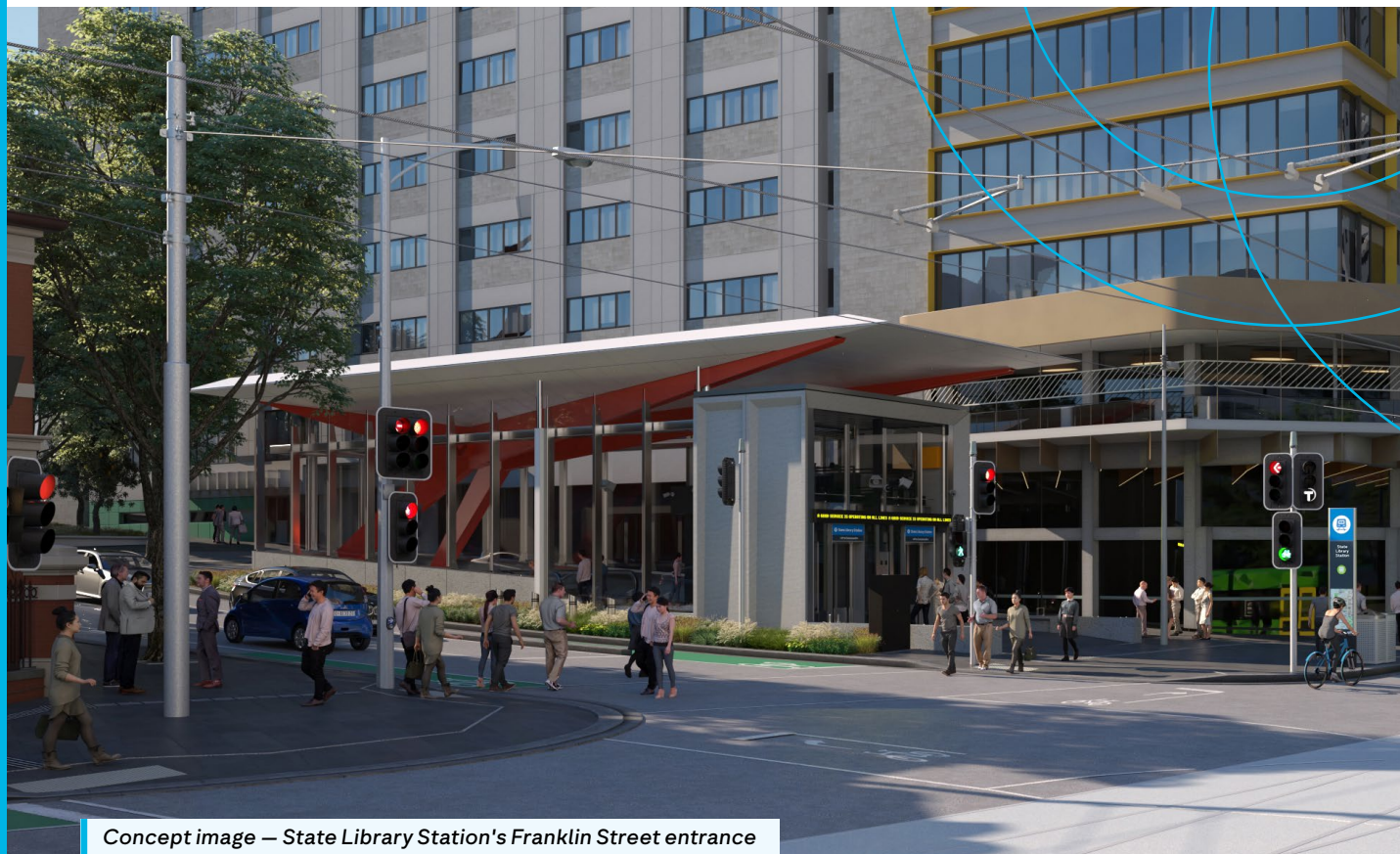
Concept image — State Library Station's Franklin Street entrance

The Metro Tunnel will connect the busy Cranbourne, Pakenham and Sunbury lines through a new tunnel under Melbourne's CBD, with bigger and more modern trains and next generation signalling for turn up and go services.