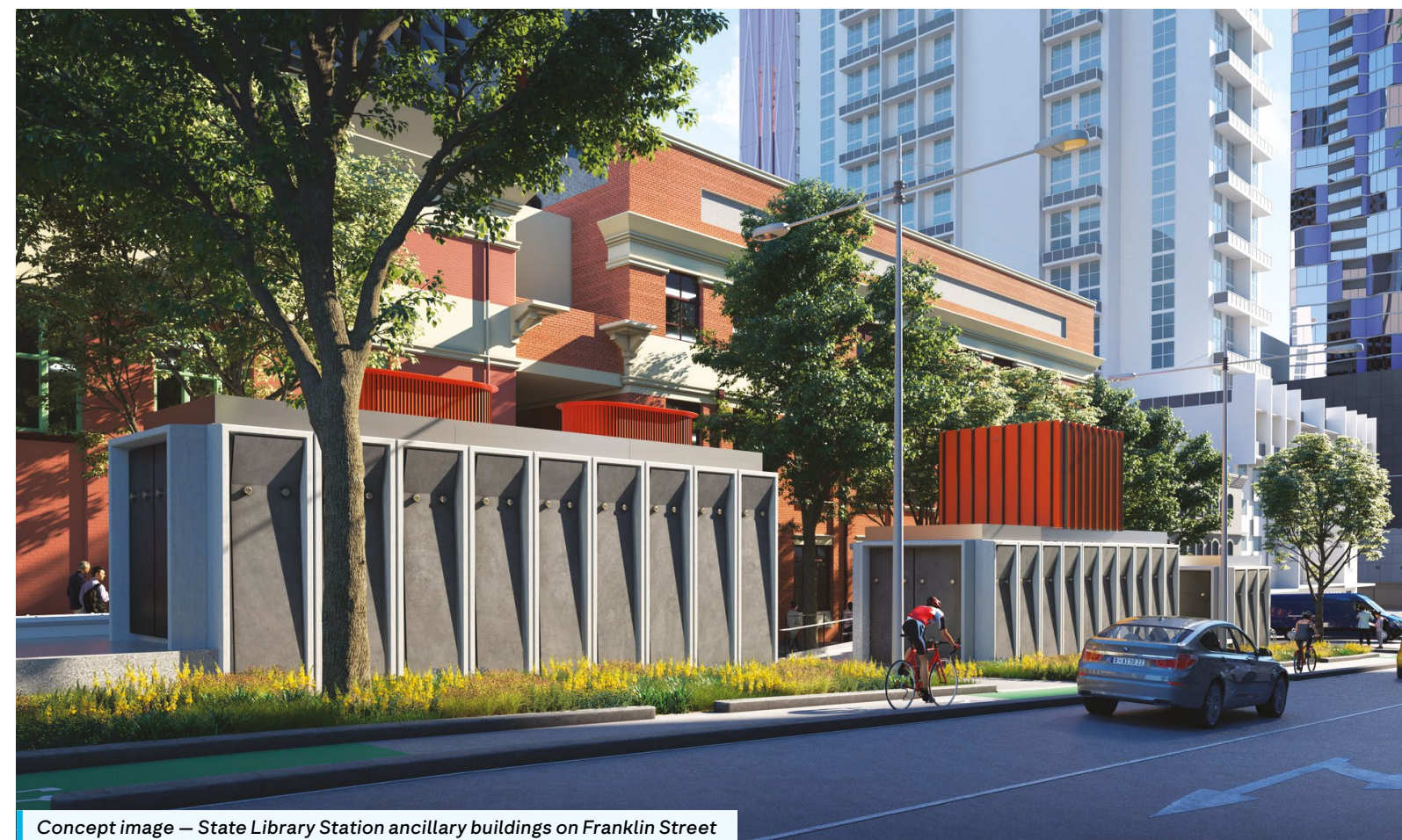
Concept image — State Library Station ancillary buildings on Franklin Street

For more information on the Transforming Franklin Street project please visit, participate.melbourne.vic.gov.au/transforming-franklin-street