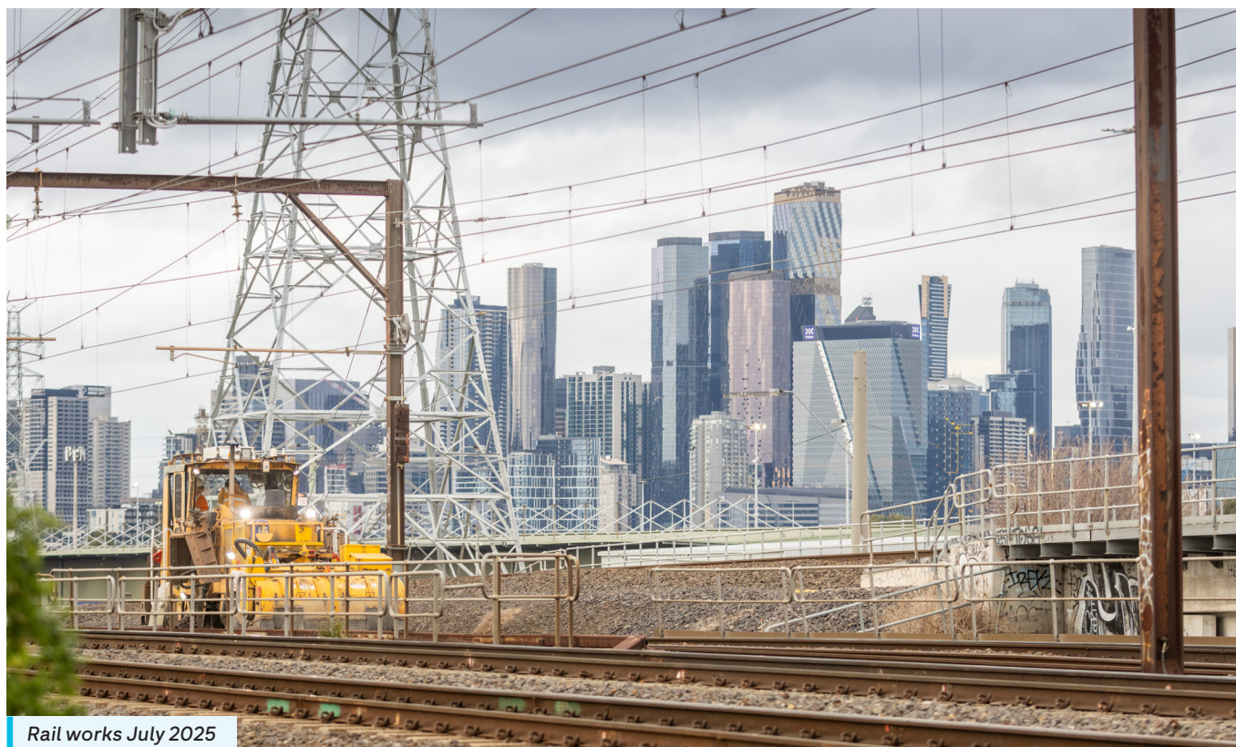
Rail works July 2025

Further information on these works can be found overleaf or at metrotunnel.vic.gov.au