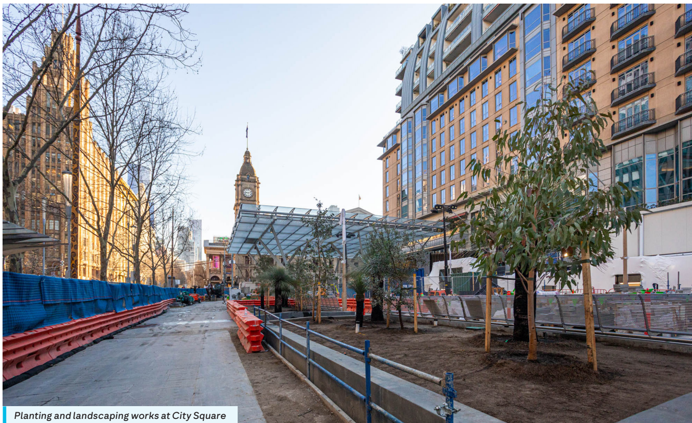
Planting and landscaping works at City Square