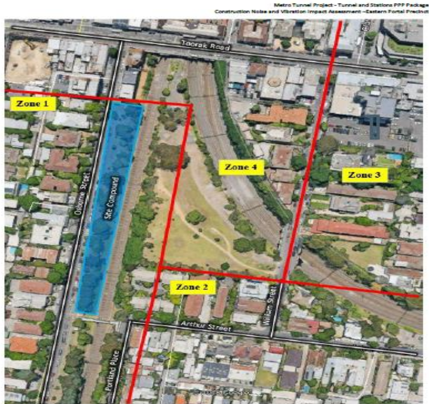
Figure 5: Background noise monitoring locations and nearby residential areas