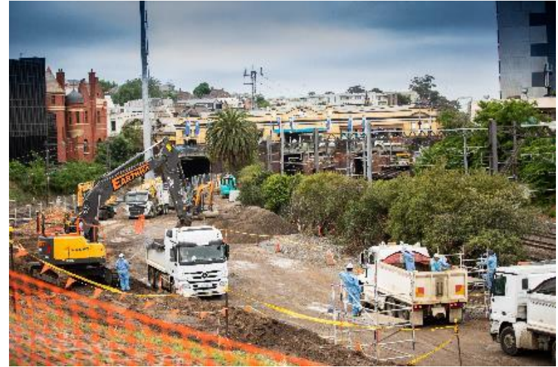
Site establishment at South Yarra Siding Reserve