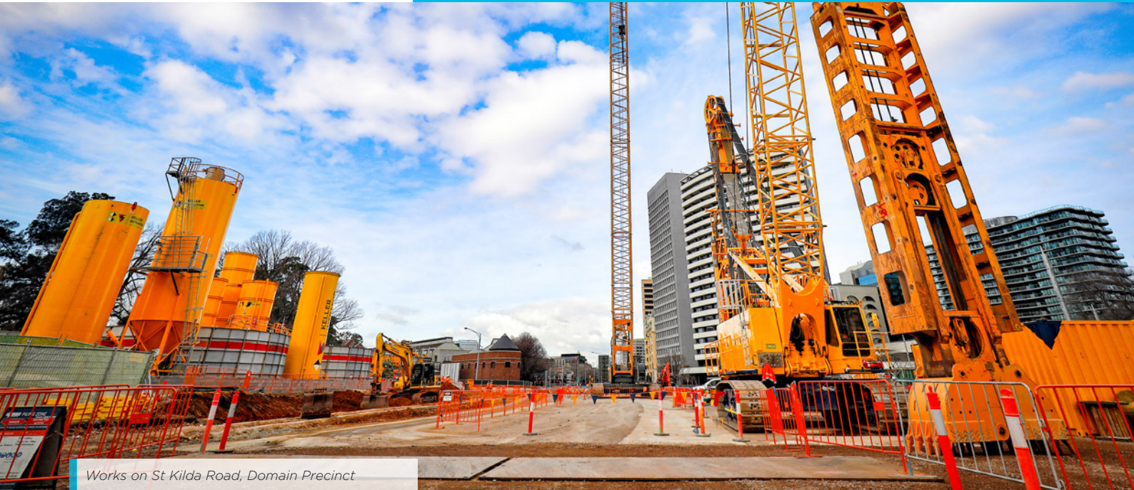
Works on St Kilda Road, Domain Precinct