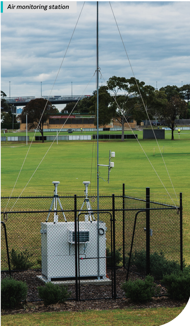
Air monitoring station

Results from the air quality monitoring stations are published on the project website: westgatetunnelproject.vic.gov.au/air-quality