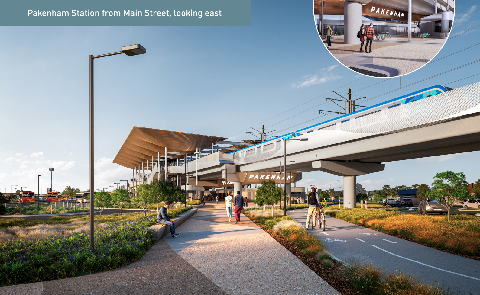
Pakenham Station from Main Street, looking east

Artist impression only - subject to change.