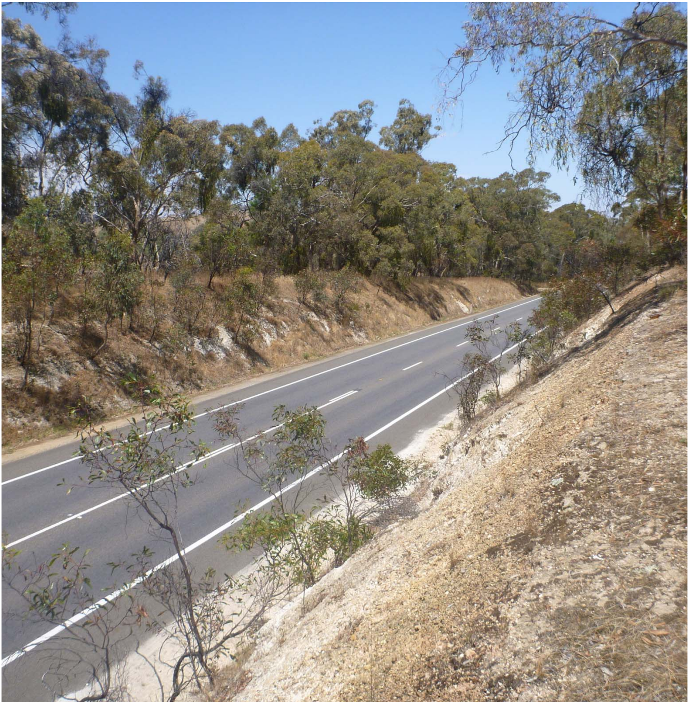
Western Highway near Ararat Regional Park