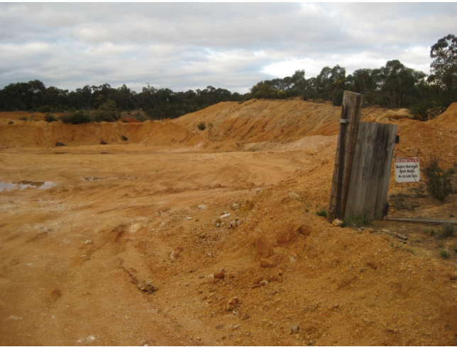
Former quarry site