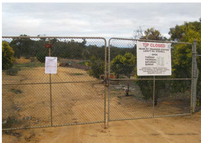
Entrance to former landfill

As there is a significant risk to human health and a potential for gross land contamination in a localised area, the impact during construction of the former landfill is considered to be major.