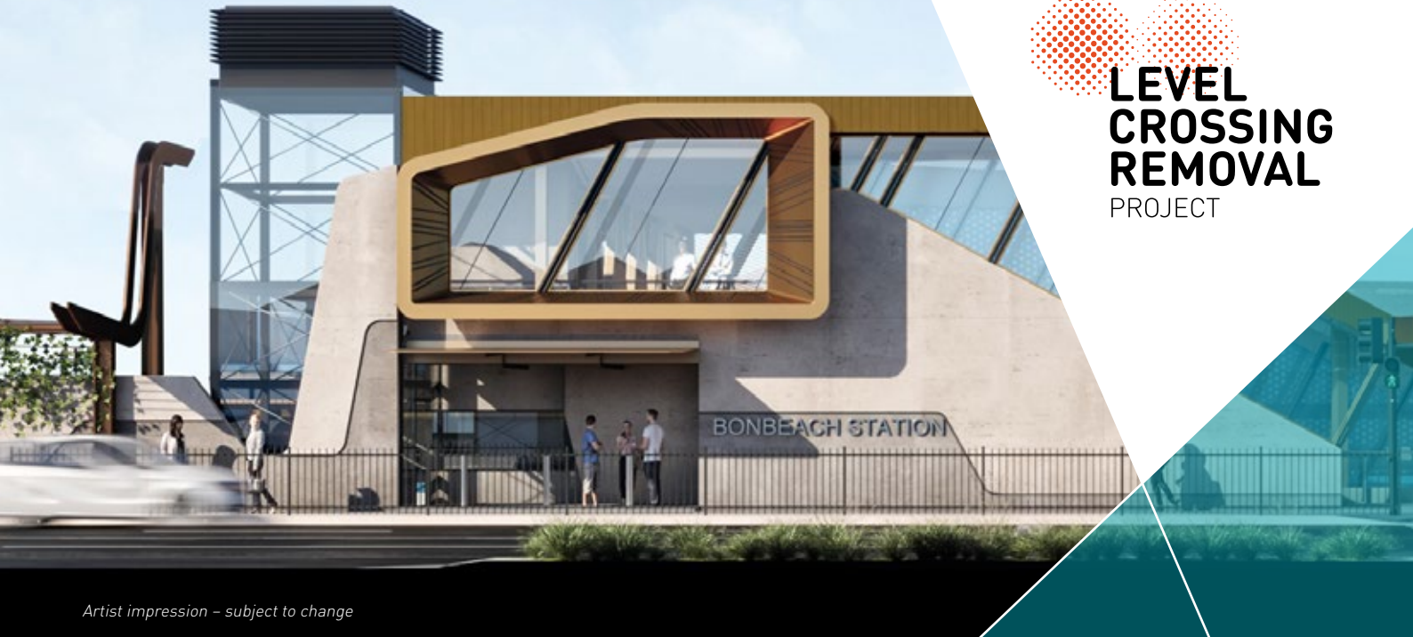
Artist impression – subject to change