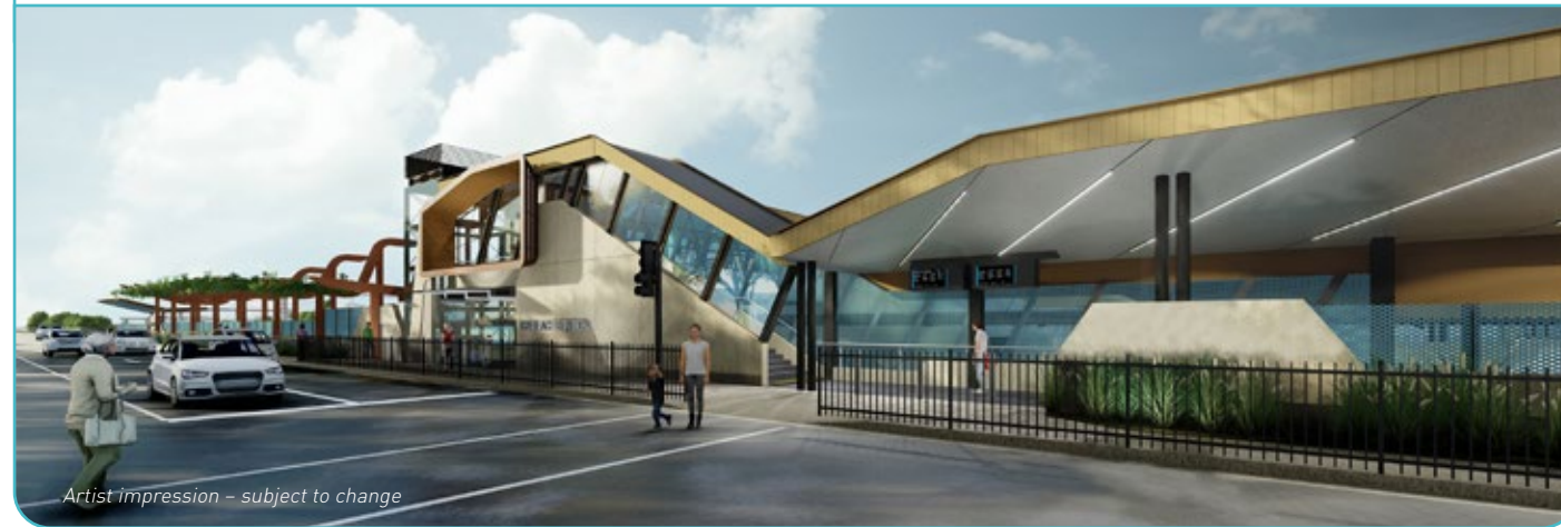
Artist impression – subject to change

The new station has its own unique features, including a large framed window for locals and visitors to enjoy a view to the ocean, and a vertical garden that will create a shaded approach to the station along Nepean Highway.