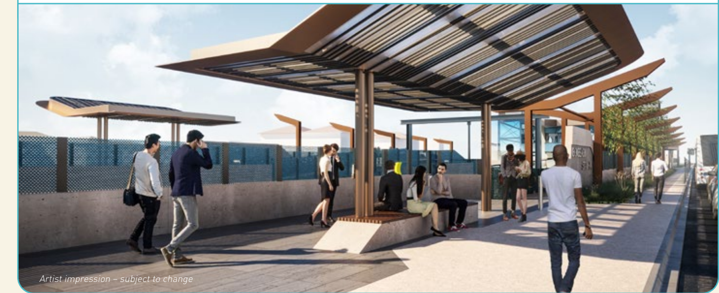
Artist impression – subject to change