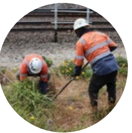
Crews safely removing vegetation for re-planting