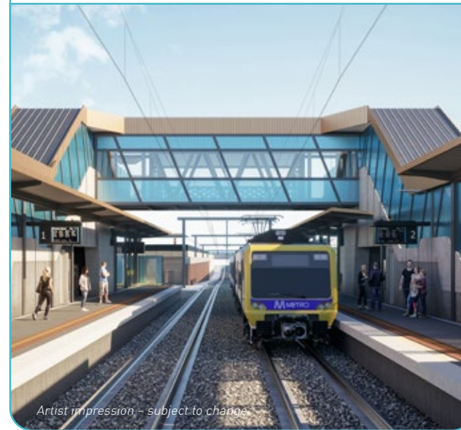
Artist impression – subject to change