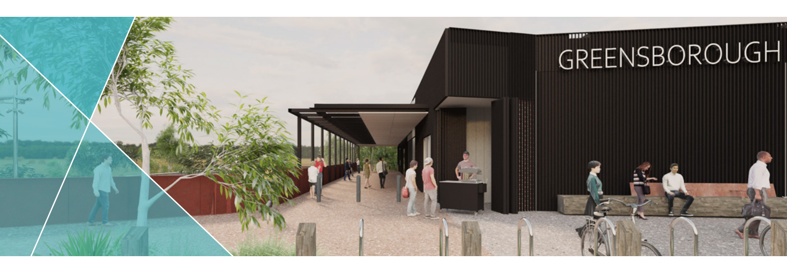
Your new Greensborough Station. Artist impression only, subject to change.