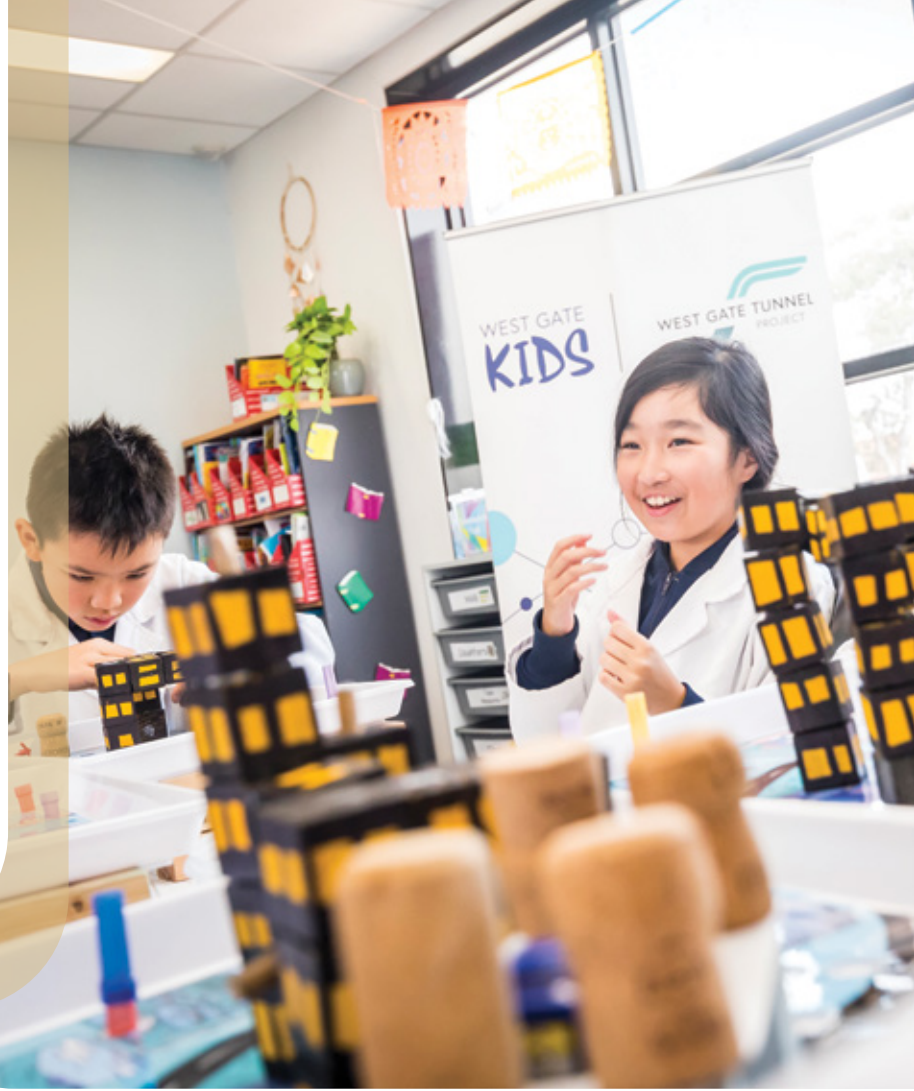
Footscray North Primary School students participating in the West Gate Tunnel Project school engagement program

With half of the participants being girls, our inspiring West Gate Kids program will hopefully have a lasting impression on these students and encourage them to take up a career in engineering and construction in the years to come.