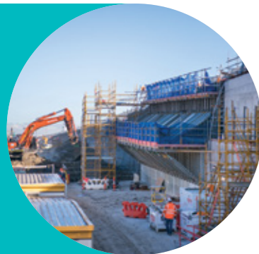
Excavation at the outbound tunnel exit

For more information on the facility, visit hiqualityecohub.com.au