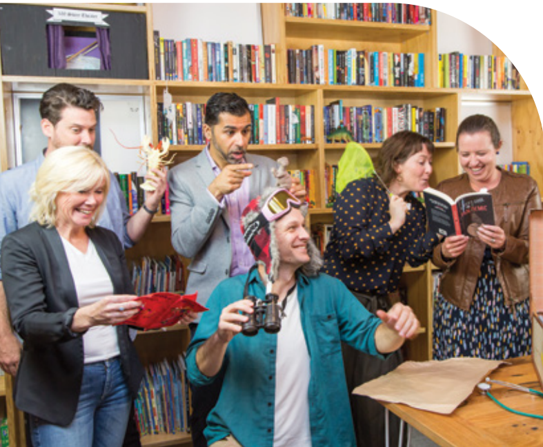
100 Story Building supports creativity and literacy in children and young people

For more information, visit westgatetunnelproject.vic.gov.au/community/grants