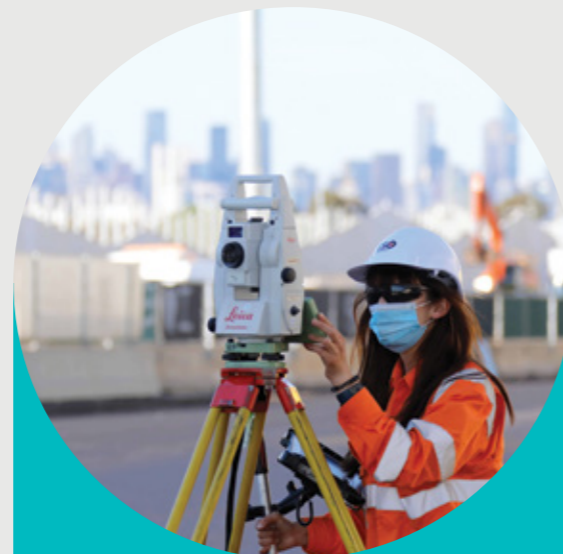
Surveying newly constructed lanes on the West Gate Freeway

So far, lane changes between Newport Bridge and Muir Street and Rosalla Road and Kyle Road have taken place and 2.3 kilometres of new lanes have been constructed.