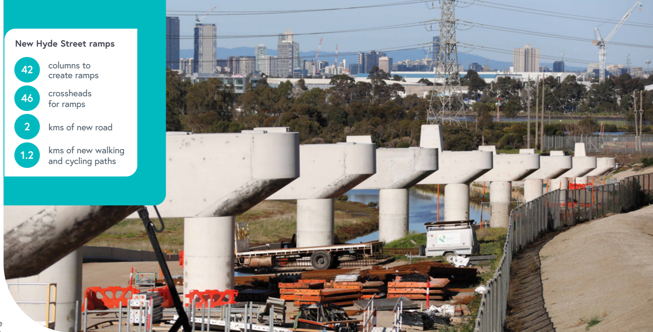
Construction of Hyde Street ramps next to Stony Creek