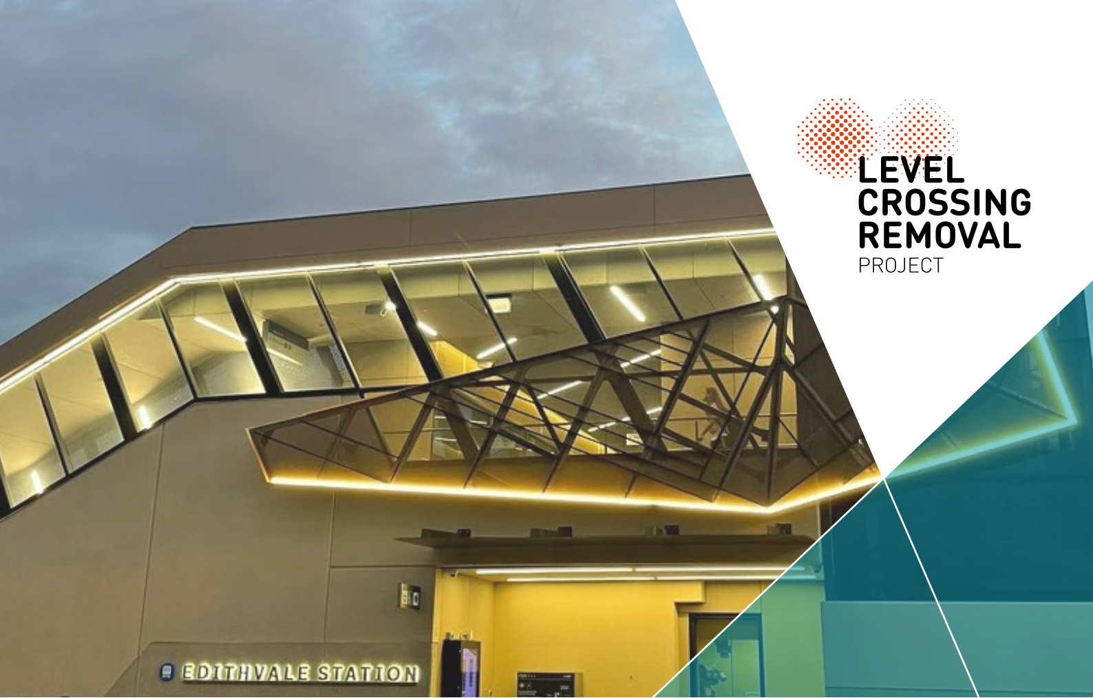
Edithvale Station opening in November 2021