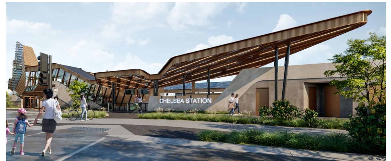
Planting at Chelsea station precinct – artists impression, subject to change

We will plant trees along Nepean Highway and Station Street that reflect the coastal dune landscape and nearby places, such as the Edithvale - Seaford Wetlands. We'll plant the trees at different stages of maturity and sizes to better blend into the surrounding environment.