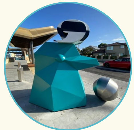
'Bonbird' taking pride of place at Bonbeach station

For more information about our public art, use the QR to check out our factsheets.