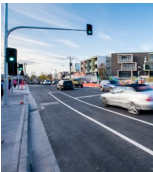
Charman Road, Cheltenham