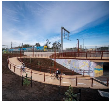
Eel Race Road underpass