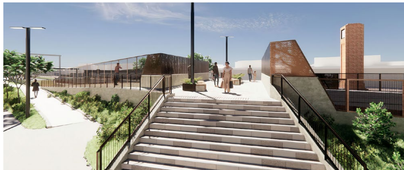
The Chelsea pedestrian bridge will open in mid 2022 – artists impression, subject to change

The iconic Chelsea heritage clock tower will also take pride of place in the new precinct.