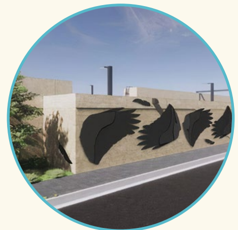
'Waa' will feature on the Nepean Highway side of the Edithvale station – artists impression, subject to change