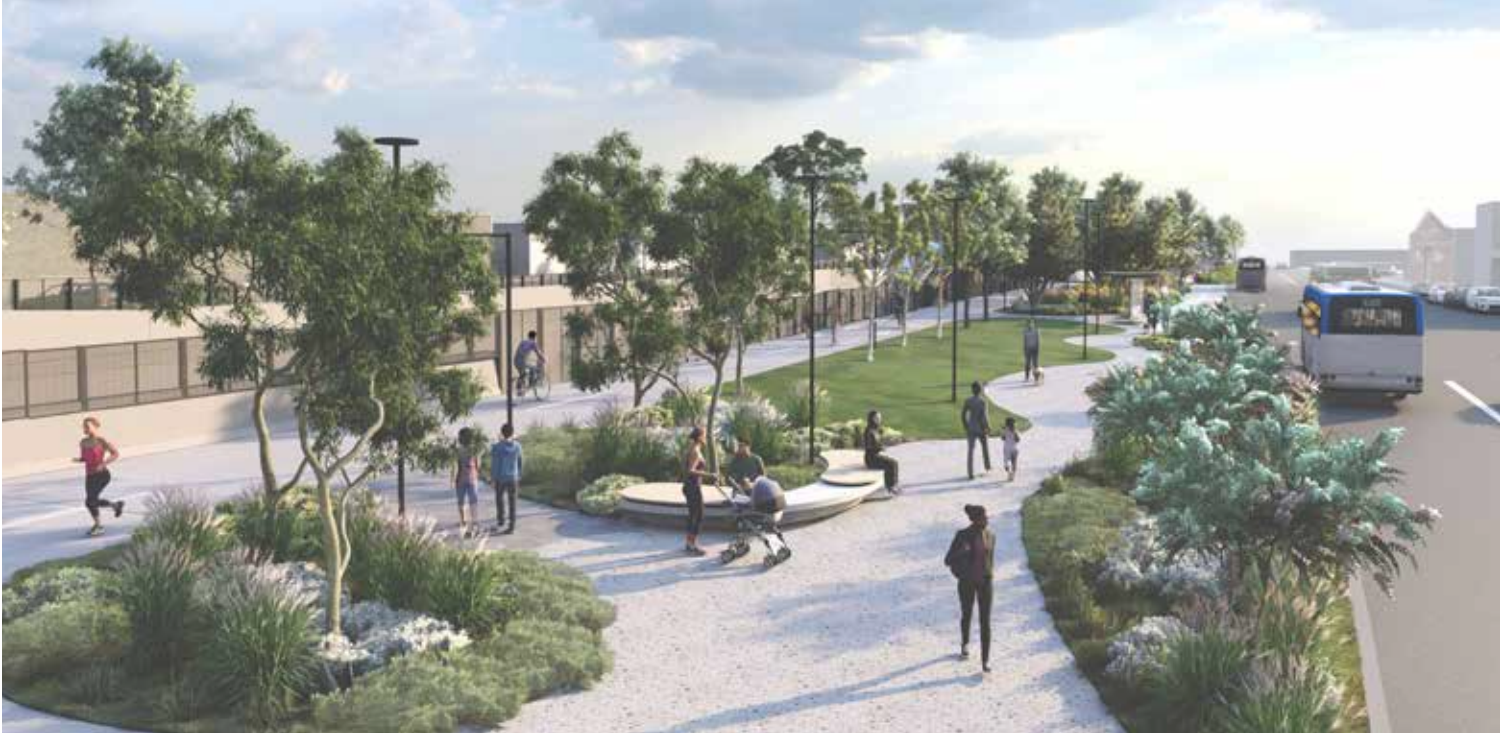
The new linear park which will run along Hartington Street. Artist's impression only.