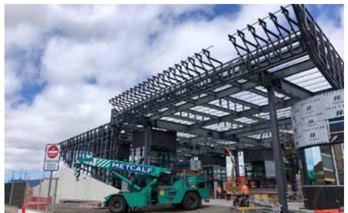
Since September, structural steel and prefabricated station buildings have been installed on site ahead of the roofing and concrete cladding.