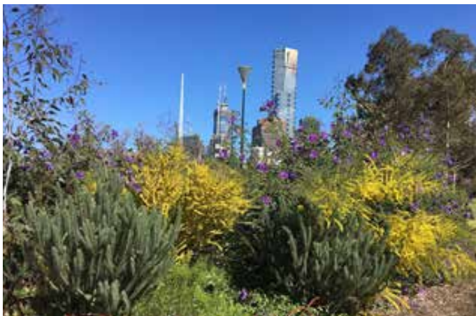
Woody Meadow at Birrarung Marr.