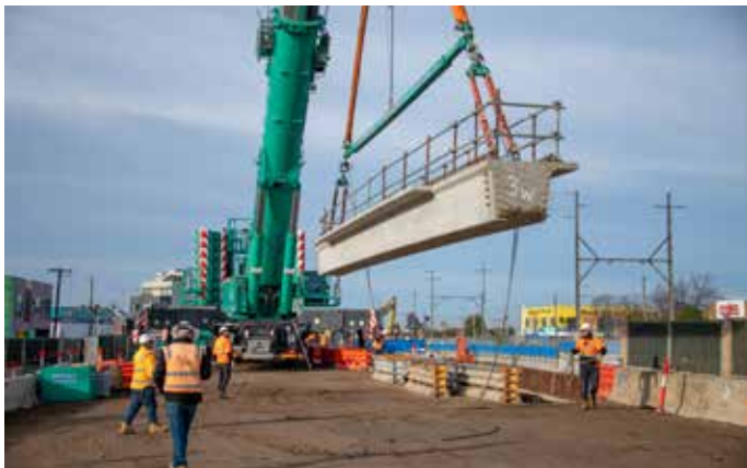
22 huge concrete beams were installed across the trench in June and July. The largest weighed 37 tonnes.

See how the new Glenroy Station is starting to take shape above the rail trench.