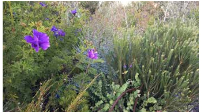
Woody Meadow at Royal Park.

The Woody Meadow is a collaborative project led by the University of Melbourne and is being rolled out across several Level Crossing Removal Projects sites including Glenroy.