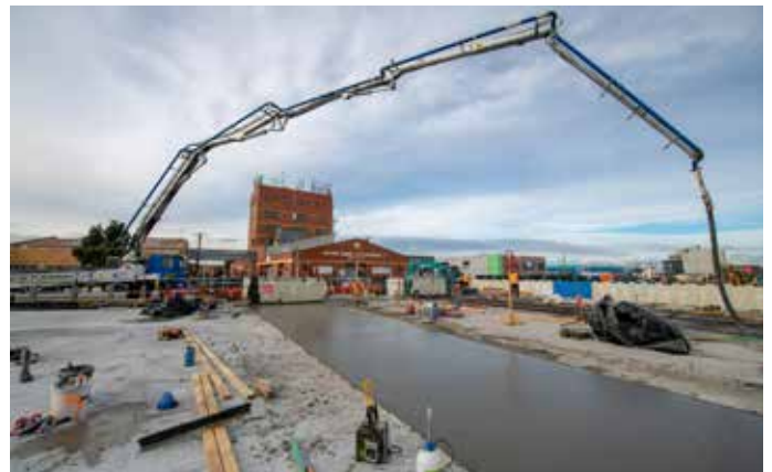
More than 500 tonnes of concrete was poured on top of the beams to create the foundations for the station