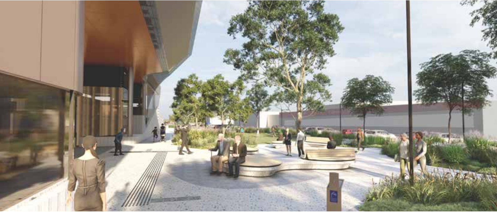
The Glenroy Station western forecourt along Dowd Place. Artist's impression only.

The majority of planting will take place in autumn and winter 2022 when the milder weather is ideal for planting.