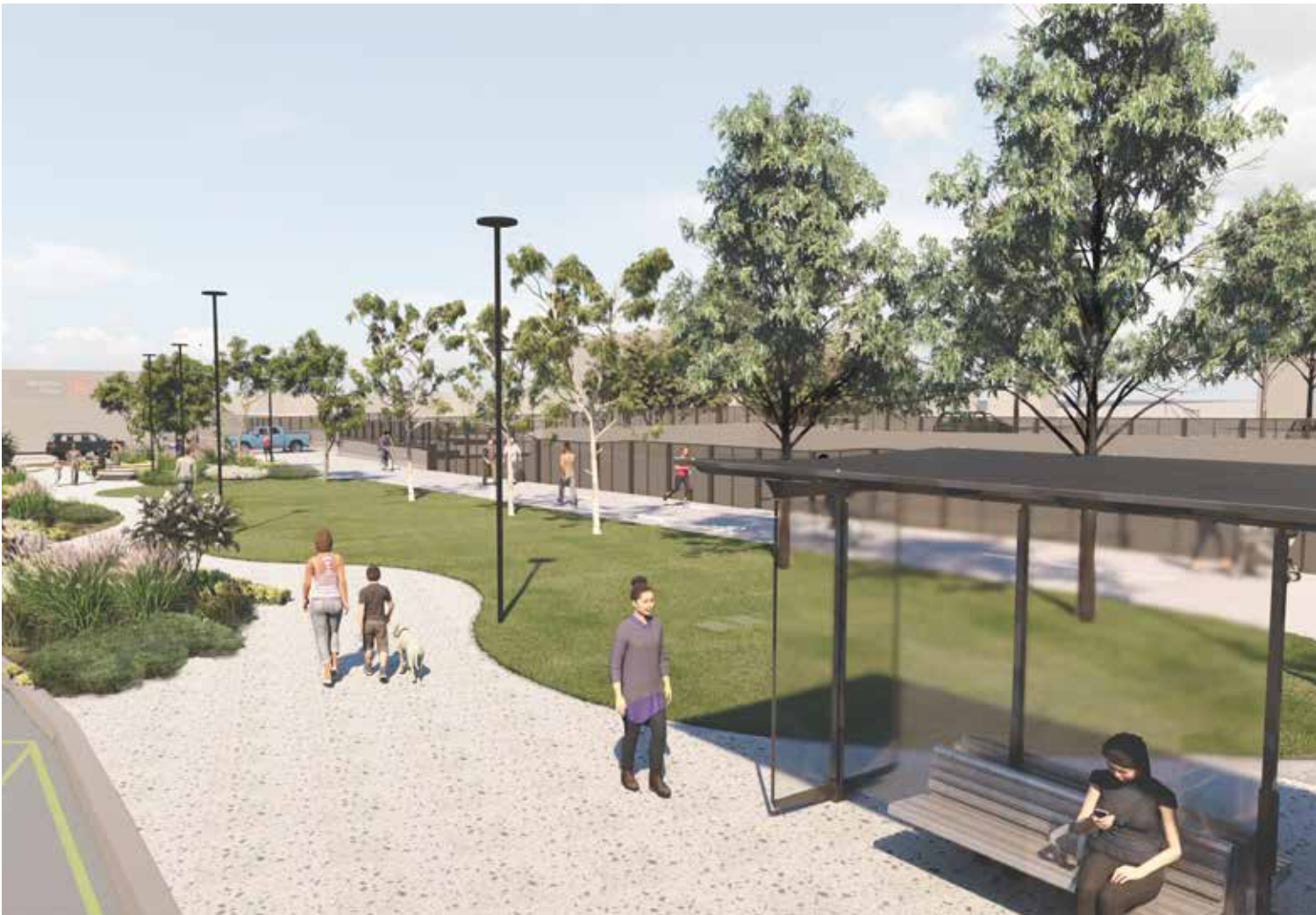
Dedicated pathways and lighting will feature in designs. Artist's impression only.

A new bus interchange will be integrated into the linear park (below), creating a welcoming area for passengers waiting for the bus or accessing the station.