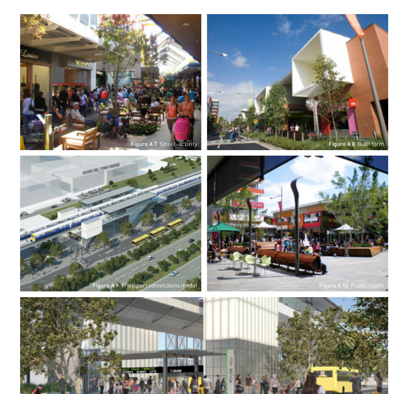
2016 | LEVEL CROSSING REMOVAL PROJECT | PRECEDENT STUDY