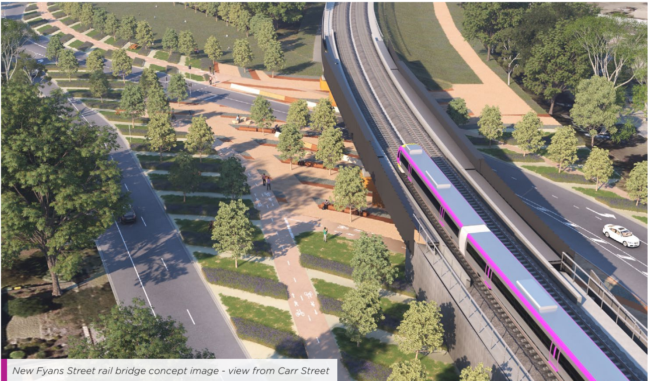
New Fyans Street rail bridge concept image - view from Carr Street

We will undertake a staged approach to constructing the project, so that we can carry out works safely and minimise disruption as much as possible.