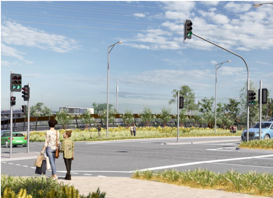
Artist's impression of Elder Street landscaped bridge, Greensborough

Before major construction gets underway in 2024, we will be in touch with residents with more details about works planned for their area and expected impacts.