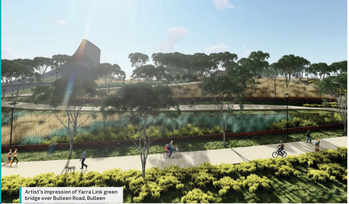
Artist's impression of Yarra Link green bridge over Bulleen Road, Bulleen