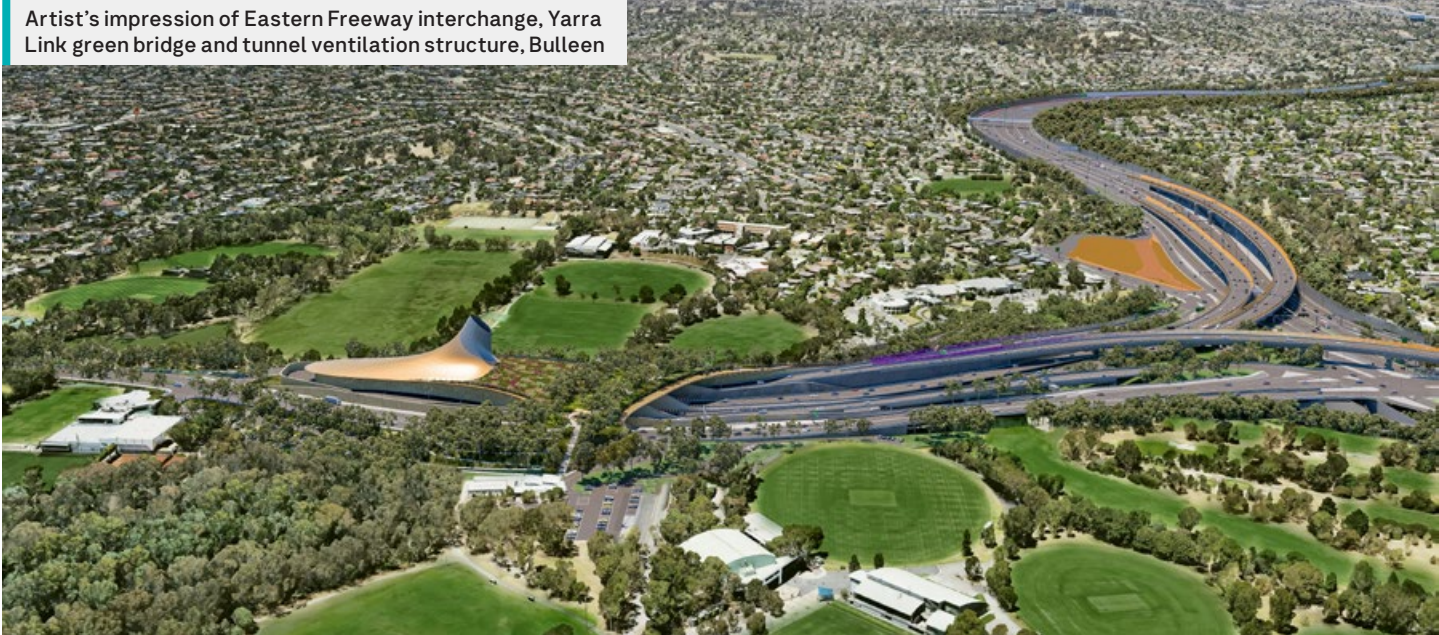
Artist's impression of Eastern Freeway interchange, Yarra Link green bridge and tunnel ventilation structure, Bulleen

The design is inspired by traditional Wurundjeri eel traps. Solar panels will help power the tunnels below.