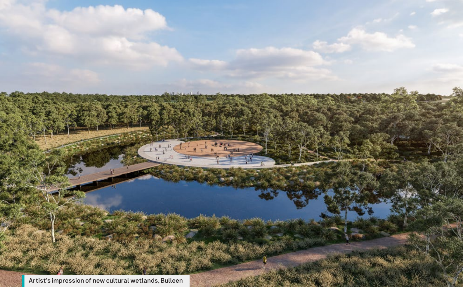
Artist's impression of new cultural wetlands, Bulleen

The North East Link Tunnels will take traffic and trucks under, instead of through, our suburbs and give local roads back to local people. We're also building new wetlands and parklands, better connecting Koonung Creek and Yarra River trails and delivering a major upgrade of the Eastern Freeway.