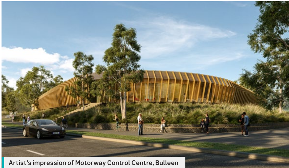
Artist's impression of Motorway Control Centre, Bulleen

The Eastern Express Busway from Doncaster towards the city is Melbourne's first dedicated busway. High-speed bus lanes will pass under the Eastern Freeway interchange ramps at up to 100km an hour. Passengers will be catching buses from the brand new Bulleen Park & Ride from early 2023, ahead of upgrades to the existing Doncaster Park & Ride.