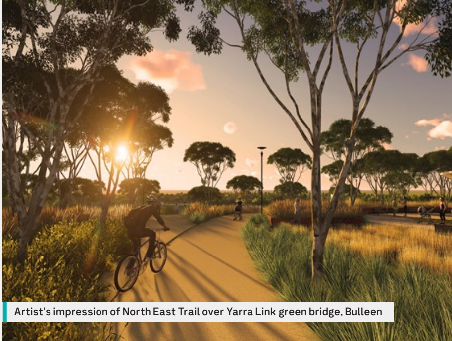
Artist's impression of North East Trail over Yarra Link green bridge, Bulleen