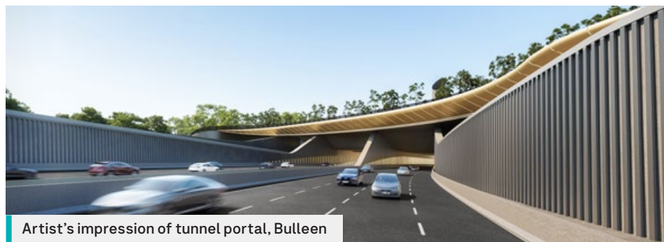
Artist's impression of tunnel portal, Bulleen

We'll use smaller mining machinery to build the tunnel under residential areas in Bulleen and cut and cover to build the section further south under the sports fields connecting through to the Eastern Freeway interchange. The ground conditions here aren't suitable for a TBM or smaller mining equipment.