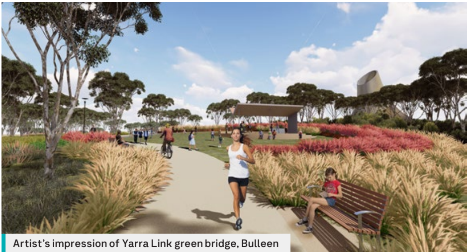
Artist's impression of Yarra Link green bridge, Bulleen

For more information about what we heard in submissions and the changes made in response, visit northeastlink.vic.gov.au