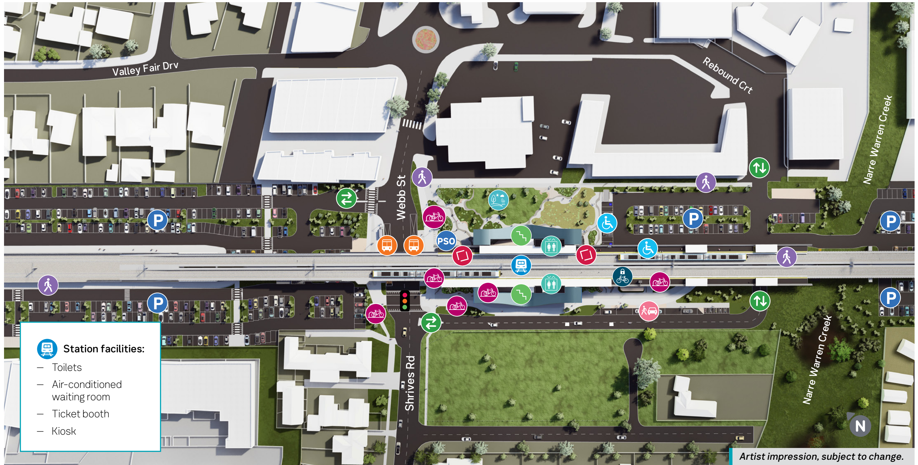
Artist impression, subject to change.