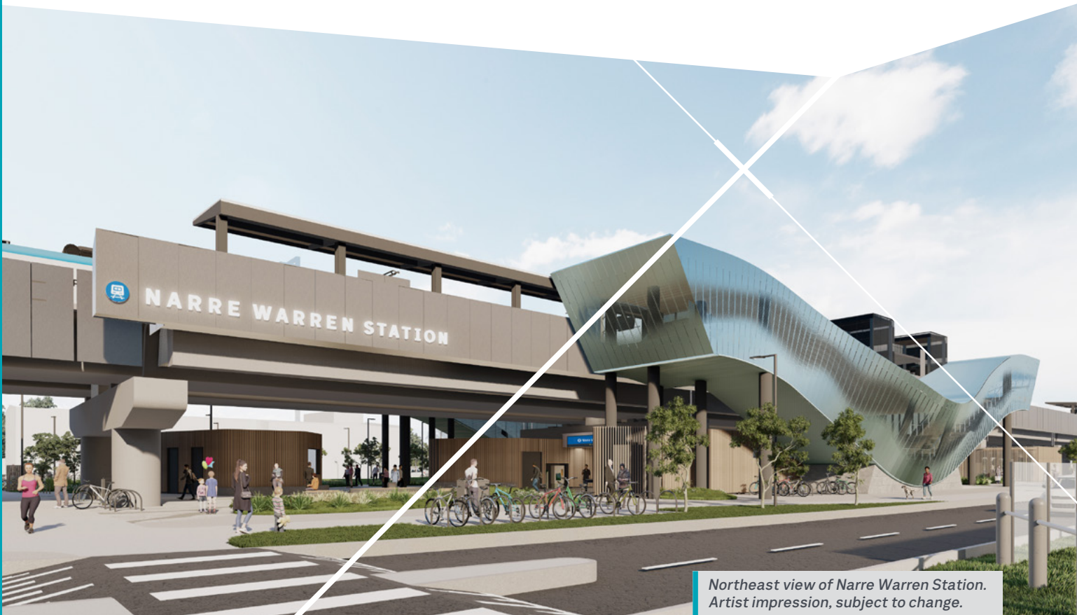
Northeast view of Narre Warren Station. Artist impression, subject to change.

For a video tour of the new Narre Warren Station.