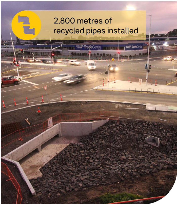
Raised sections of the road to improve flood resistance.