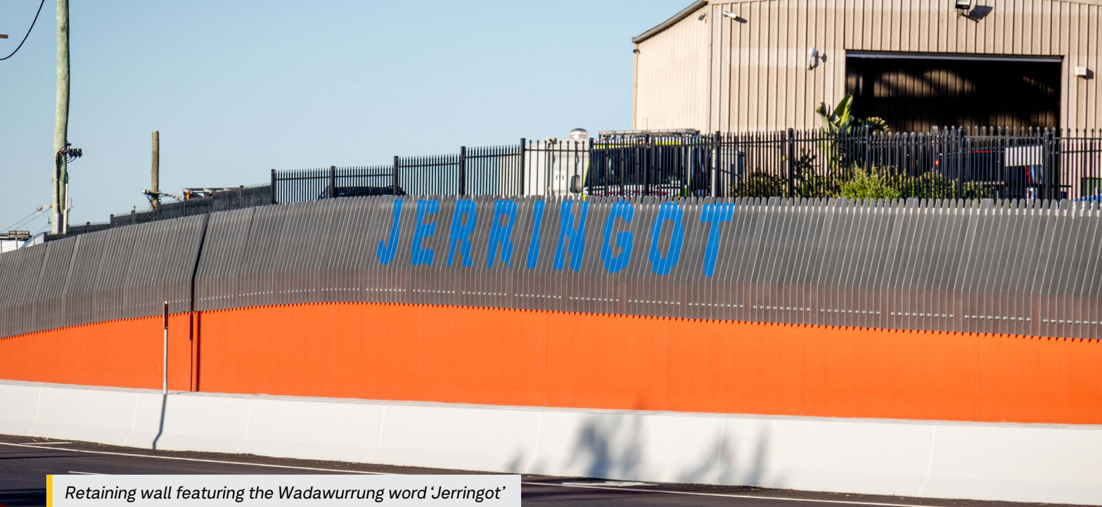
Retaining wall featuring the Wadawurrung word 'Jerringot'