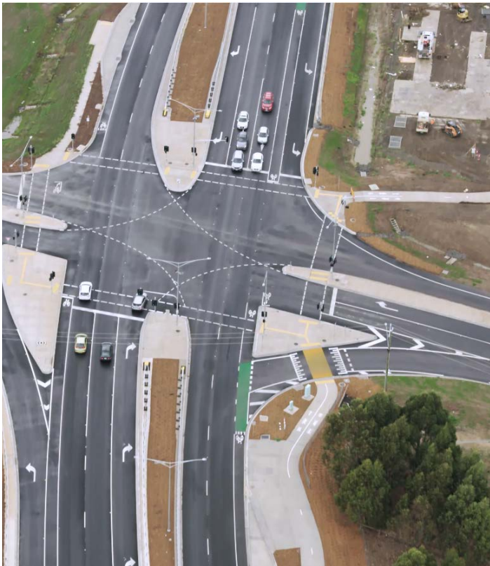
Intersection upgrades with traffic lights for improved traffic flow, safety and side-road access.