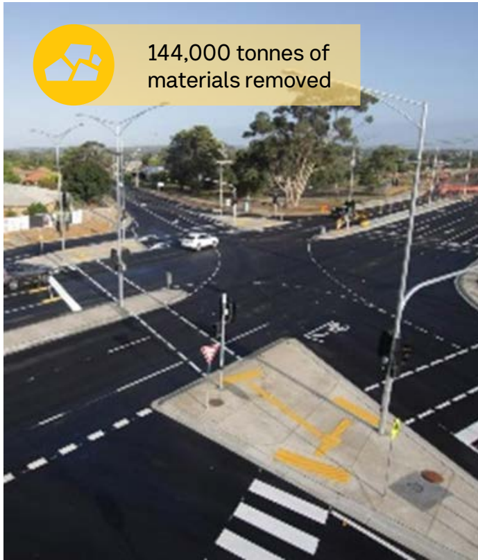
Replacing the roundabout at Marshalltown Road with a signalised intersection.