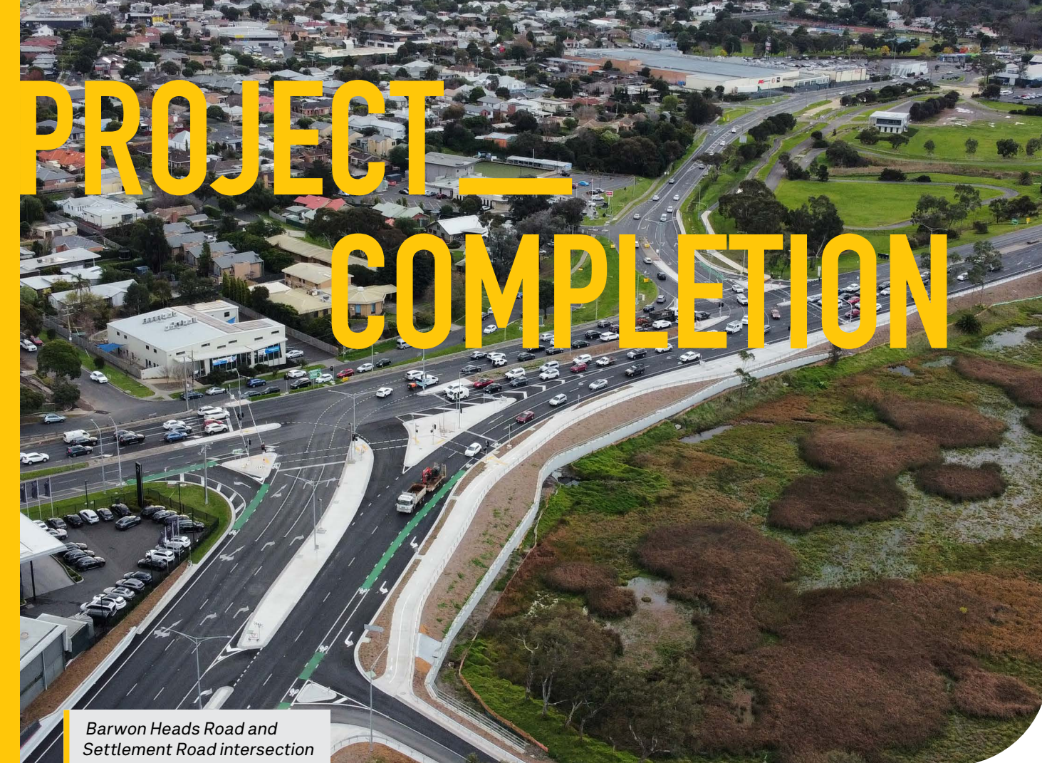
Barwon Heads Road and Settlement Road intersection