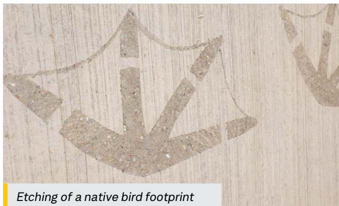
Etching of a native bird footprint