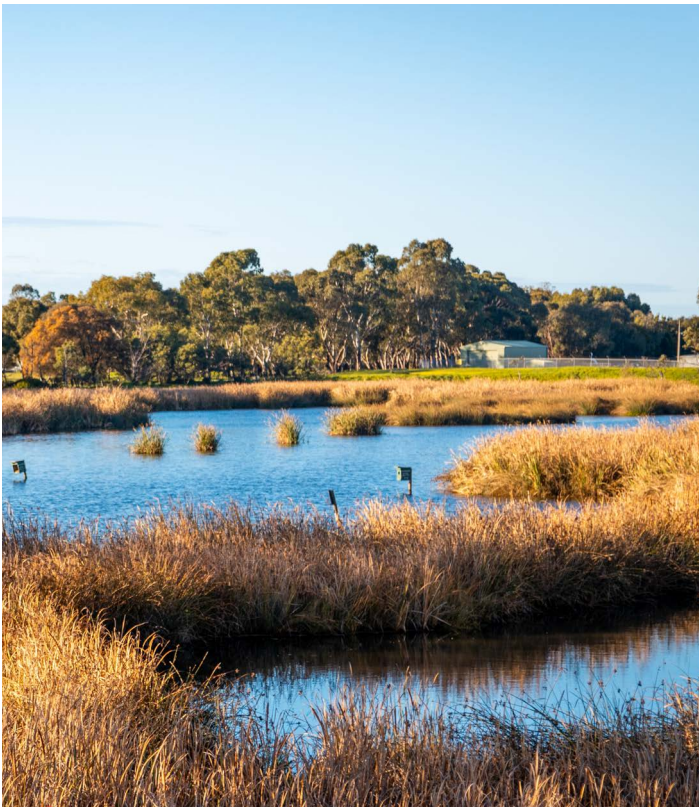
Suspended section of path protects Jerrigot wetlands and enhances view.