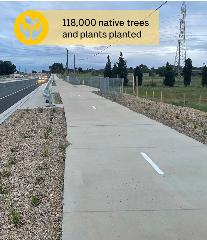
New walking and cycling path encourages active transport options while improving connectivity.