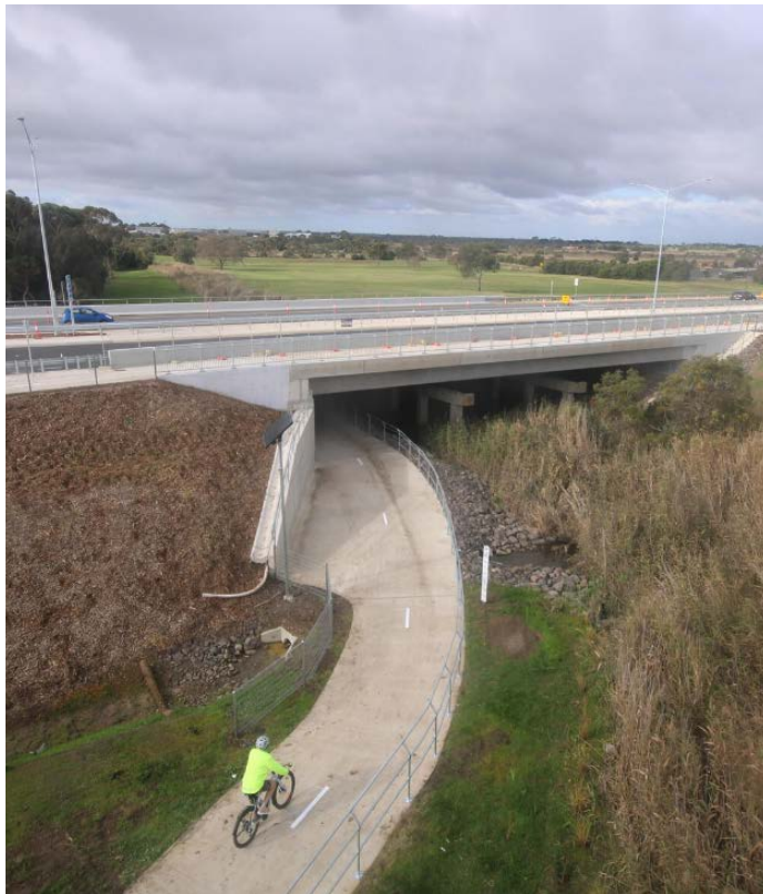
Underpass at the Waurin Ponds Creek Bridge improves access to South Barwon Reserve.