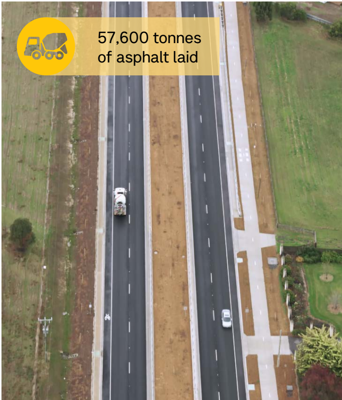
4km of new lanes make travel safer and more reliable.