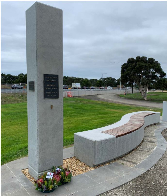
South Barwon Reserve memorial upgraded with additional amenities.