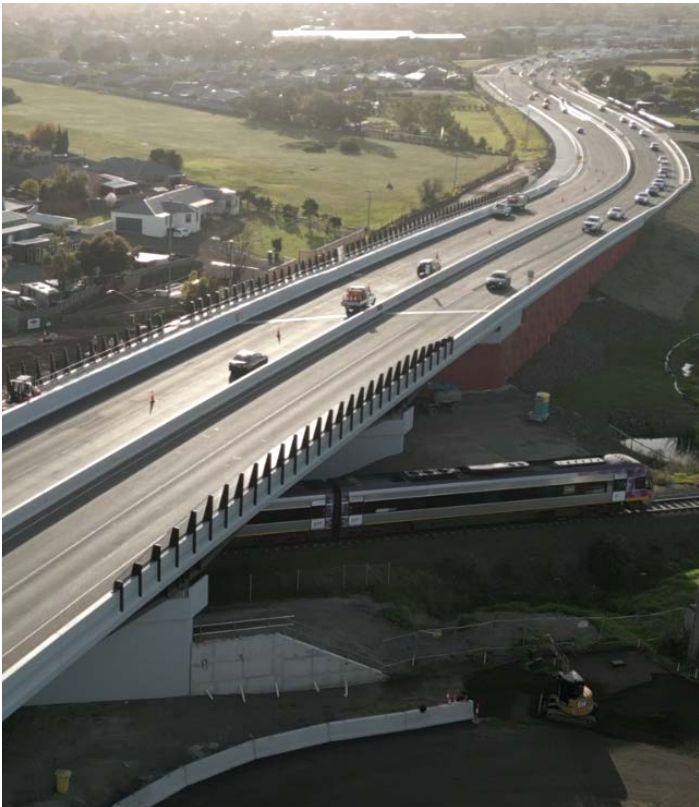
New bridge over the rail at Marshall removes level crossing and reduces queuing.