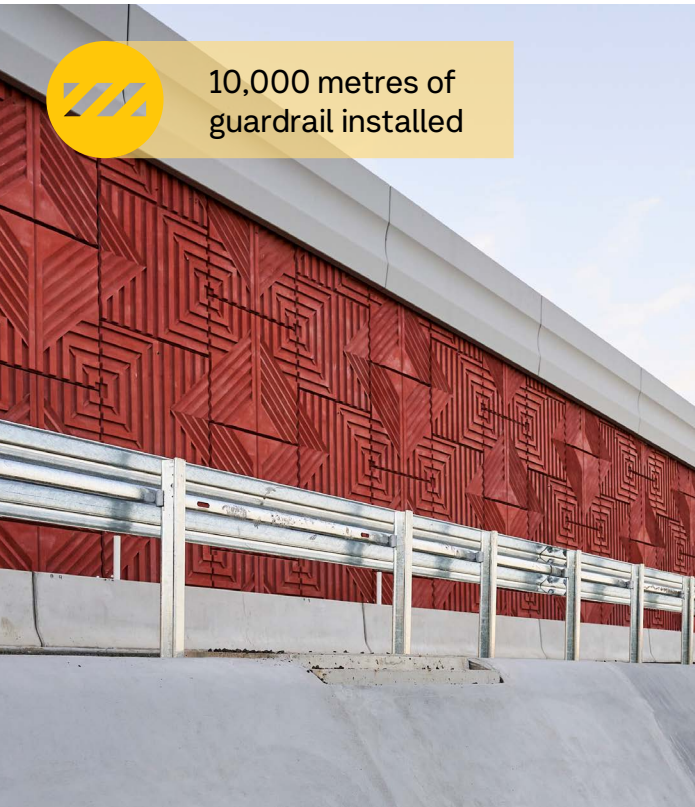
Aboriginal design and art elements reflect local culture.