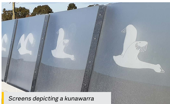
Screens depicting a kunawarra