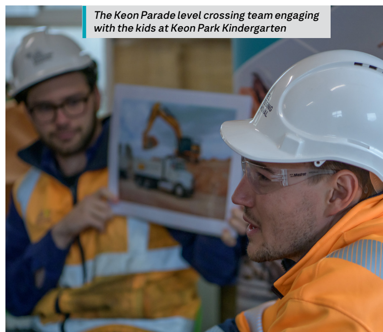
The Keon Parade level crossing team engaging with the kids at Keon Park Kindergarten

The eager kindergarteners were taught about the project by the team's engineers. Excited and raring to go, they took part in a range of activities, including building their very own refurbished Keon Park Station out of Duplo blocks.