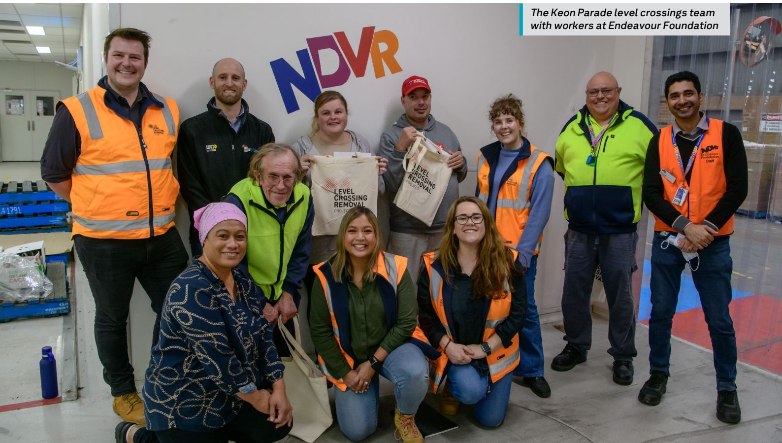
The Keon Parade level crossings team with workers at Endeavour Foundation

'Thank you all for making the time to attend our Stakeholder Meeting. It was a pleasure having you all! You were surely the highlight of the day for our employees. Looking forward to the next one.'