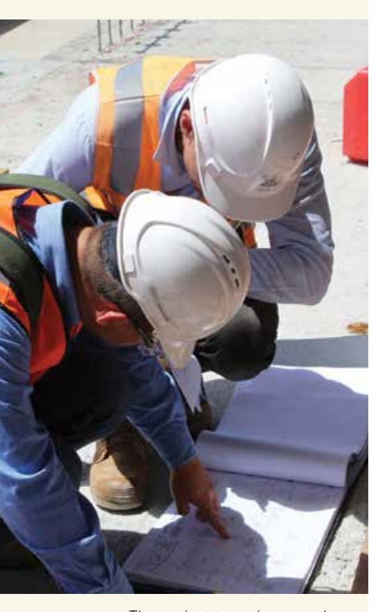
The project team inspect plans for the retail buildings.

Pedestrians should always cross the road safely at one of the new pedestrian crossings and drivers should obey traffic signals at all times. Remember: safety is everyone's responsibility.