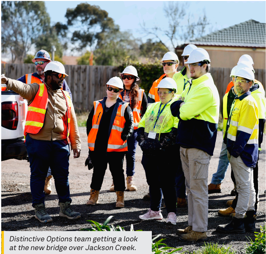
Distinctive Options team getting a look at the new bridge over Jackson Creek.

The Distinctive Options team have collectively delivered more than 29,000 community newsletters just like this one, walking over 950 kilometres, and working more than 1400 hours for the Sunbury Road Upgrade so far, aiding our community engagement team in a continued effort to keep locals informed.