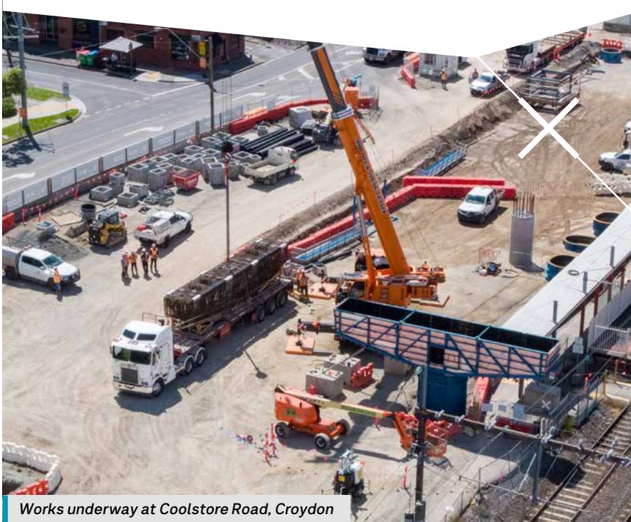
Works underway at Coolstore Road, Croydon