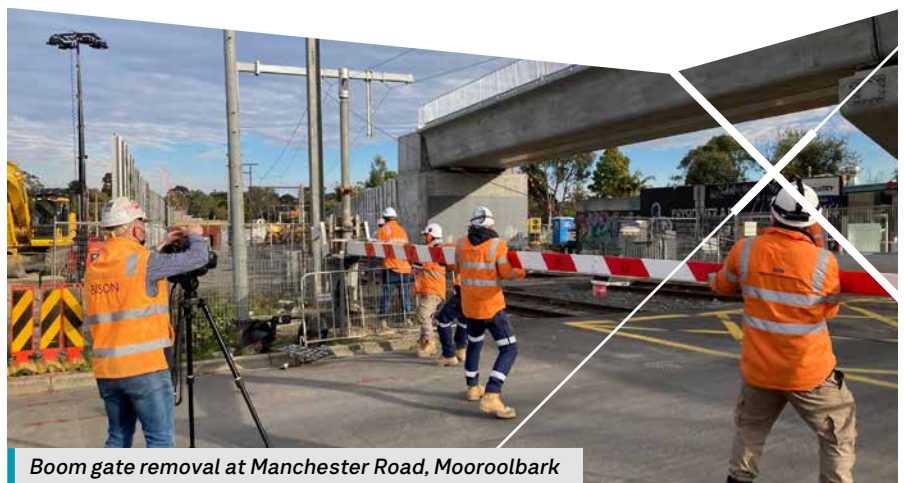
Boom gate removal at Manchester Road, Mooroolbark

To reduce any impacts, we aim to move trucks - particularly those carrying excavated material - away from construction sites and onto the arterial road network via Maroondah Highway.