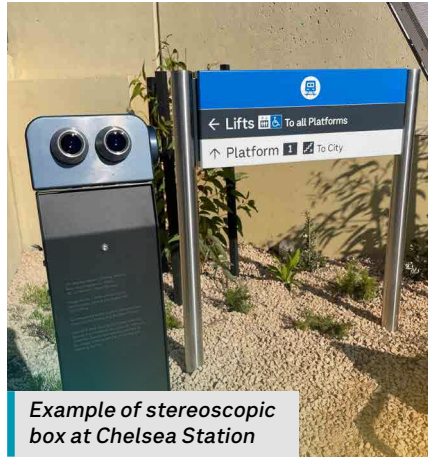
Example of stereoscopic box at Chelsea Station

To commemorate the old station building we will install an image viewer, or stereoscopic box, showing an image of the former Parkdale Station.