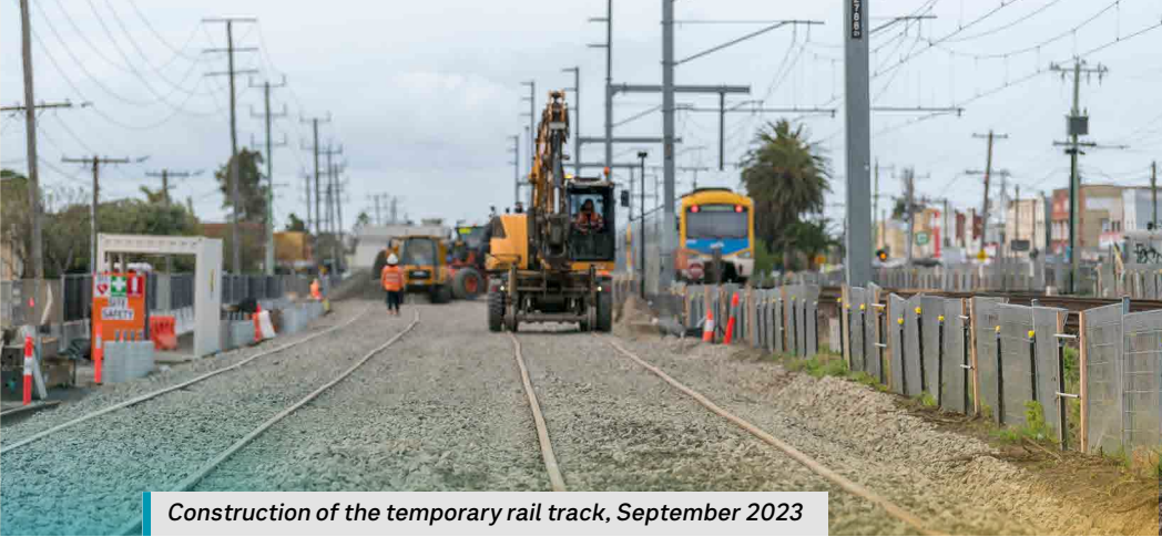
Construction of the temporary rail track, September 2023