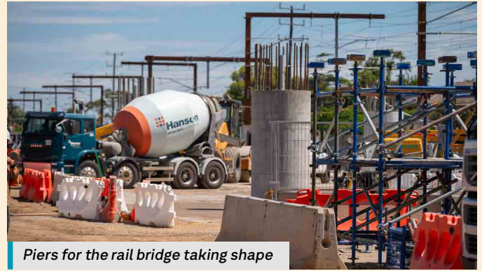
Piers for the rail bridge taking shape

Scan the QR code or visit levelcrossings.vic.gov.au/parkdale-rail-bridge-factsheet