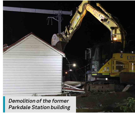
Demolition of the former Parkdale Station building