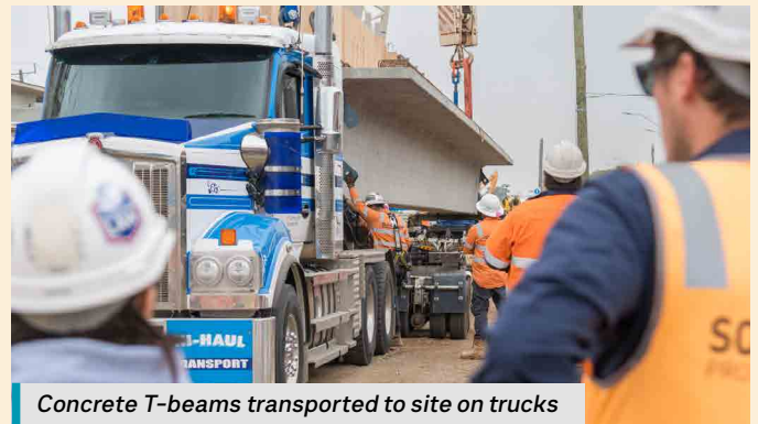
Concrete T-beams transported to site on trucks