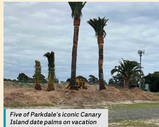
Five of Parkdale's iconic Canary Island date palms on vacation