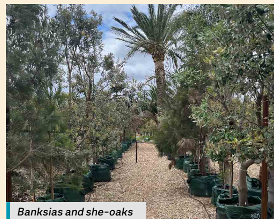
Banksias and she-oaks