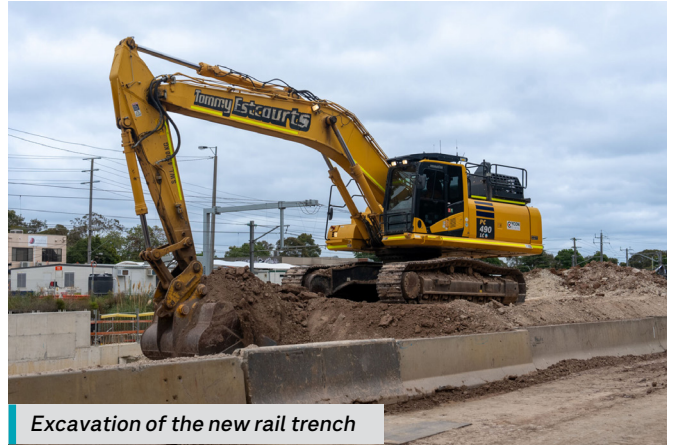
Excavation of the new rail trench