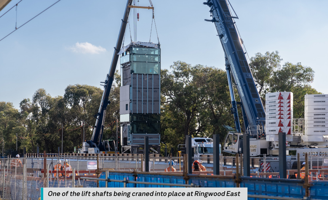
One of the lift shafts being craned into place at Ringwood East