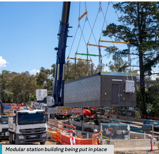
Modular station building being put in place