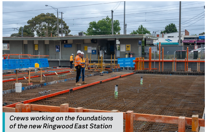
Crews working on the foundations of the new Ringwood East Station