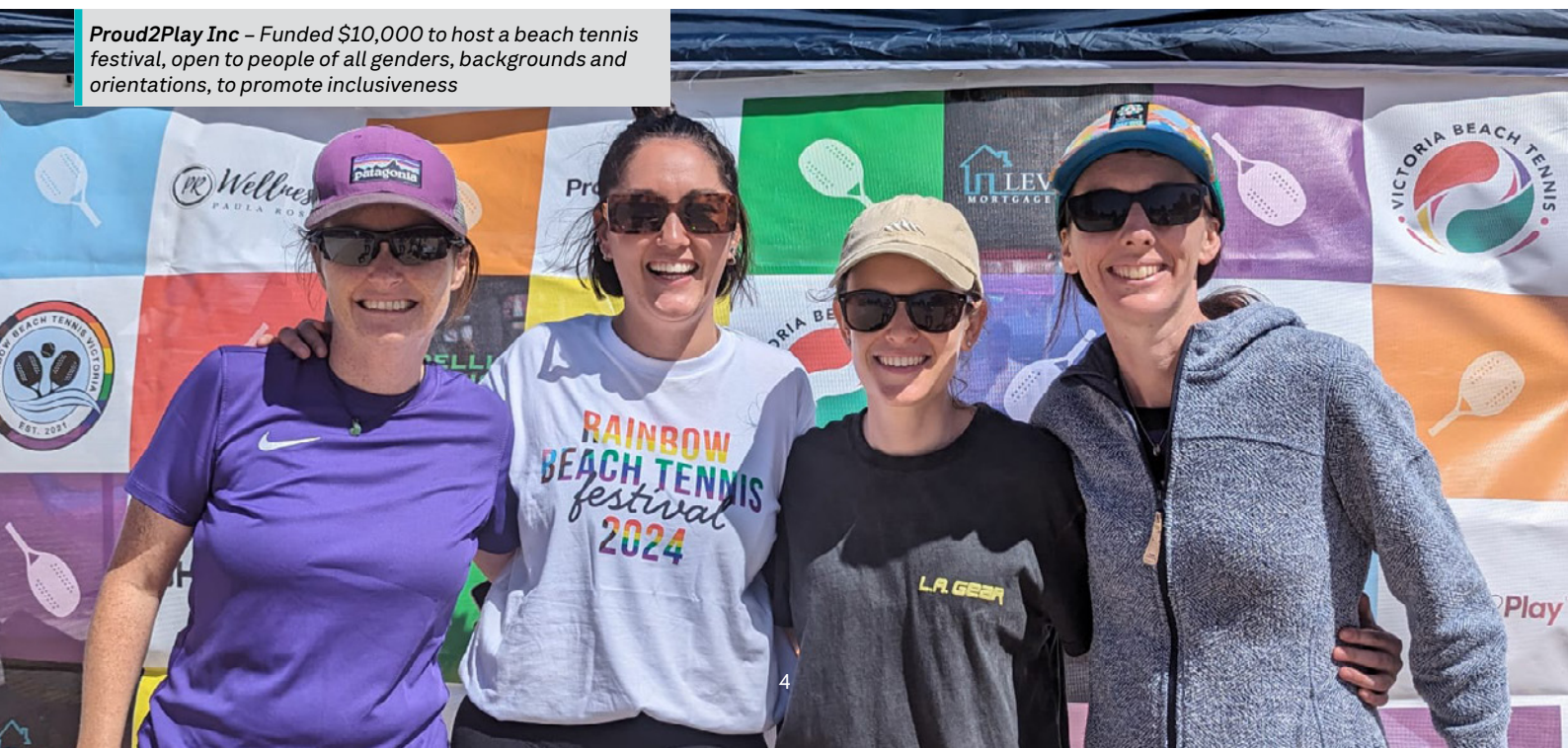
Proud2Play Inc – Funded $10,000 to host a beach tennis festival, open to people of all genders, backgrounds and orientations, to promote inclusiveness