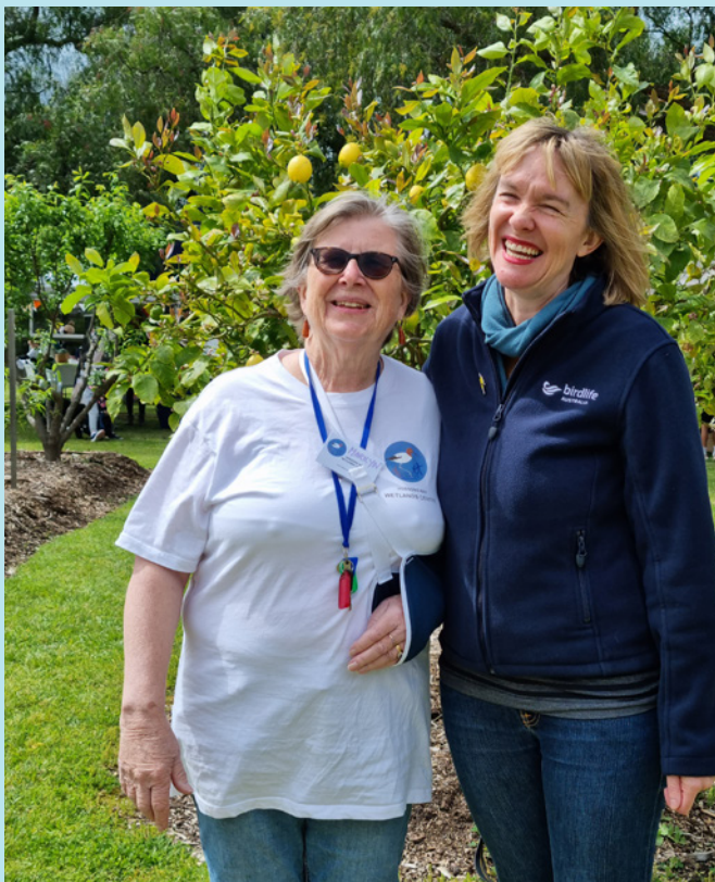
Hobsons Bay Wetlands Centre – Funded $20,000 through a Connecting Neighbourhoods Grant to deliver an Open Day for the annual World Mental Health Day that included inspirational speakers, meditative walks and art.