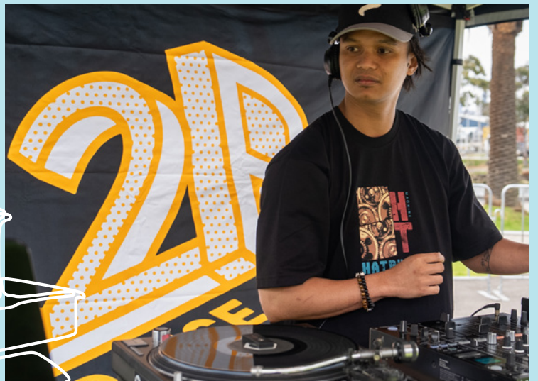
L2R Dance – Funded $45,000 through a Transforming Neighbourhoods Grant to optimising L2R Dance's headquarters, and deliver a free creative community celebration featuring contemporary street dance/hip hop culture, dance battles and performances.