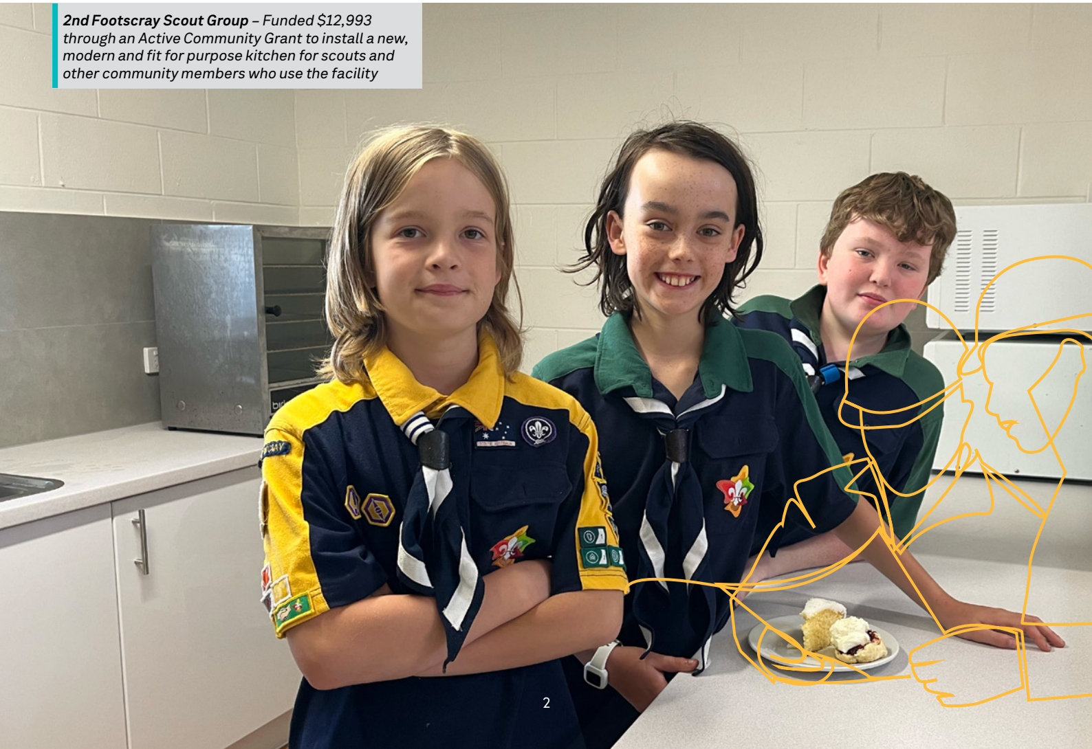
2nd Footscray Scout Group – Funded $12,993 through an Active Community Grant to install a new, modern and fit for purpose kitchen for scouts and other community members who use the facility

All applicants will be notified of the outcome of their application via email.