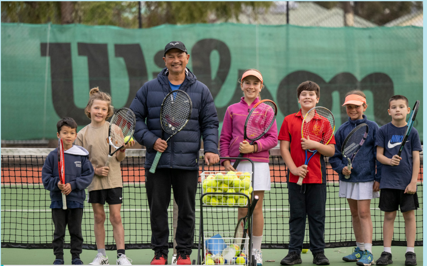
Brooklyn Tennis Club – Funded $4,000 through a Connecting Neighbourhoods Grant to deliver new nets and posts to create fit for purpose court facilities for use by the local club and community.