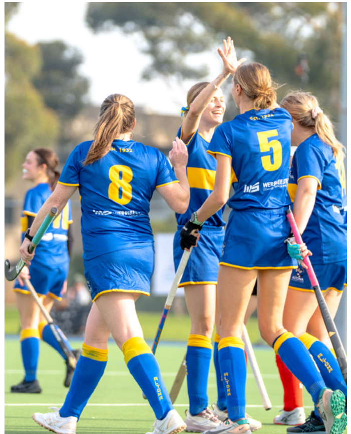
Altona Hockey Club – Funded $48,000 through an Active Community Grant to install a large electronic scoreboard to improve player, coach and spectator experience room

To discuss any privacy concerns or request access or other changes to the information The West Gate Tunnel Project (MRPV) holds about you, please contact us on 1800 105 105 or email info@wgta.vic.gov.au .