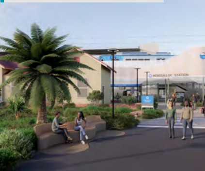
Reinstated Canary Island date palm in the new station forecourt. Artist impression, subject to change.

We've cared for and returned more than 50 palms along the Frankston Line while we removed level crossings at Glen Huntly, Ormond, McKinnon, Bentleigh, Cheltenham, Parkdale and Carrum.