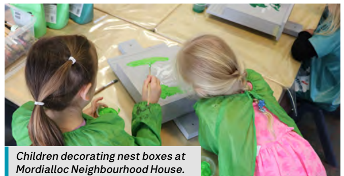
Children decorating nest boxes at Mordialloc Neighbourhood House.

We will also install nearly 30 nest boxes to provide comfortable nesting opportunities for native birds and wildlife in locations selected by wildlife experts, away from construction activities.