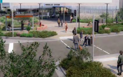
Mordialloc Station precinct. Artist impression, subject to change.

More than 85,000 plants, shrubs and grasses