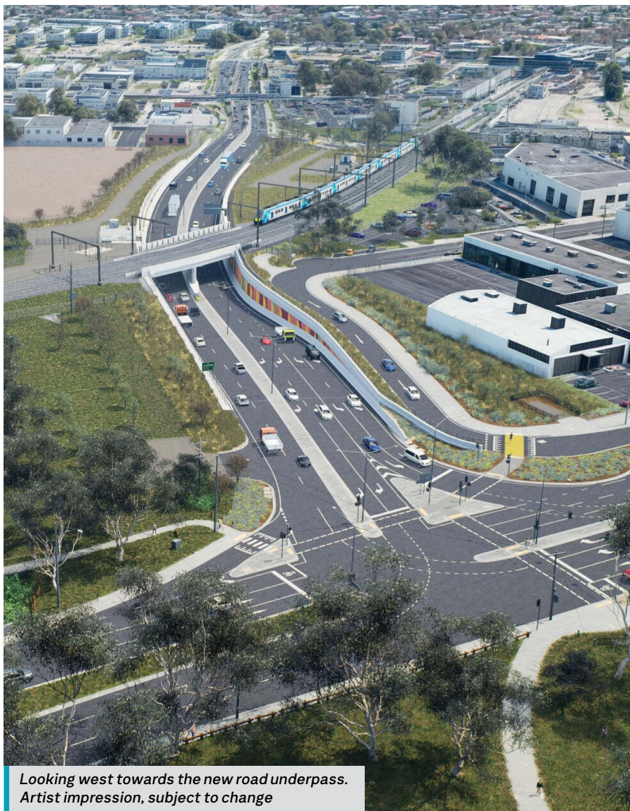
Looking west towards the new road underpass. Artist impression, subject to change