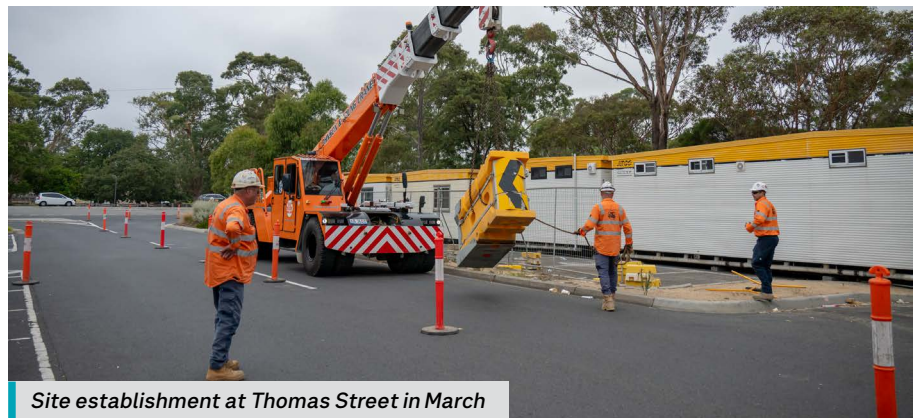
Site establishment at Thomas Street in March

Road underpass excavations will start east of the rail line after utility relocations are complete next year.