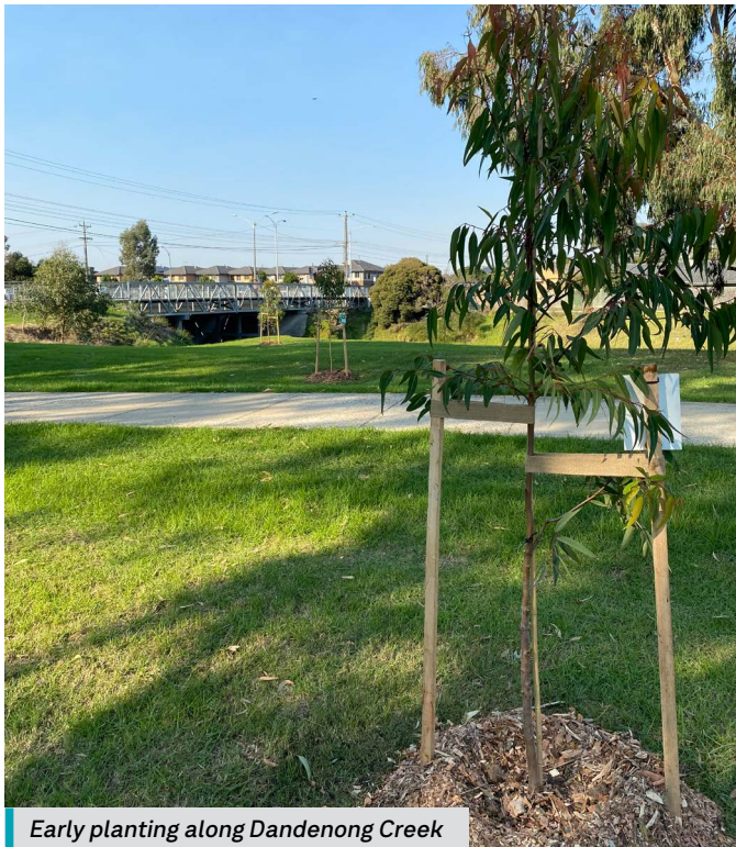
Early planting along Dandenong Creek

We'll plant 30,000 native trees, shrubs and flowering plants.