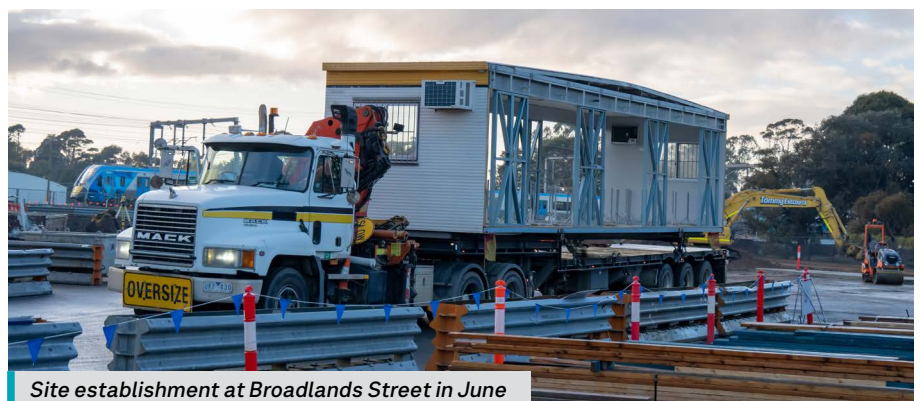
Site establishment at Broadlands Street in June