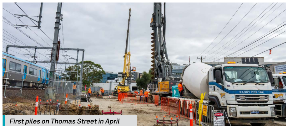
First piles on Thomas Street in April