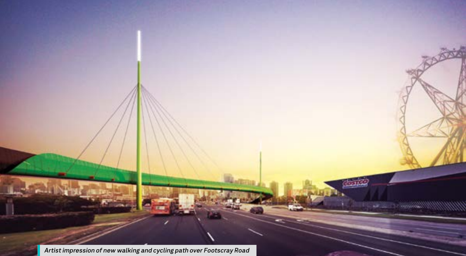
Artist impression of new walking and cycling path over Footscray Road