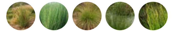
Tall Rush Green Rush Tall Sedge Rush Sedge Soft Twig-sedge