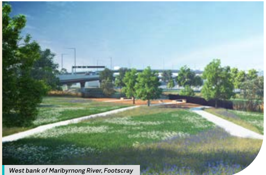
West bank of Maribyrnong River, Footscray

Sign up for updates at westgatetunnelproject.vic.gov.au