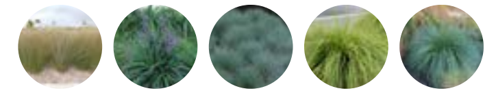
Jointed Wire Rush Blue Flax Lily Blue Fescue Basket Grass Tussock-grass