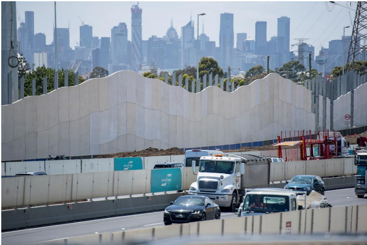
New noise walls installed along Fogarty Avenue, Yarraville

Please note that works are subject to change and could be rescheduled in the event of unexpected impacts to the construction program.