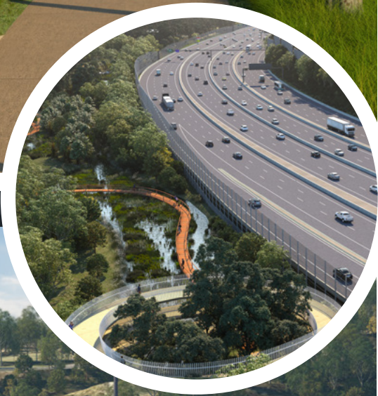
‘Koonung Creek Valley’ character area