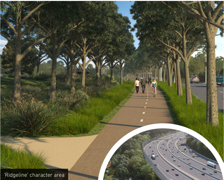
‘Ridgeline’ character area

To get involved visit jointheconversation.northeastlink.vic.gov.au