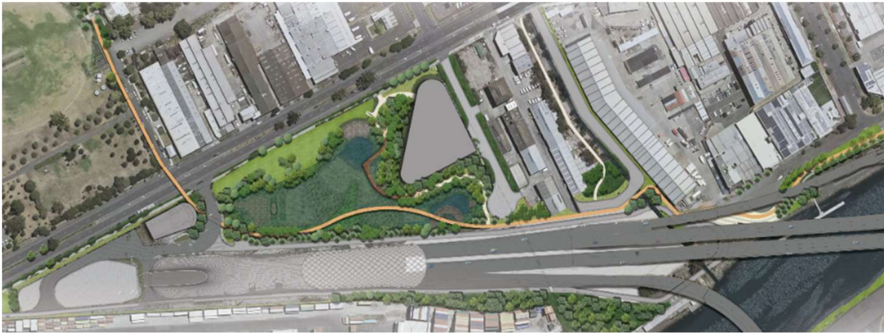
Aerial render of the Northern Portal site in Yarraville once WGTP is completed