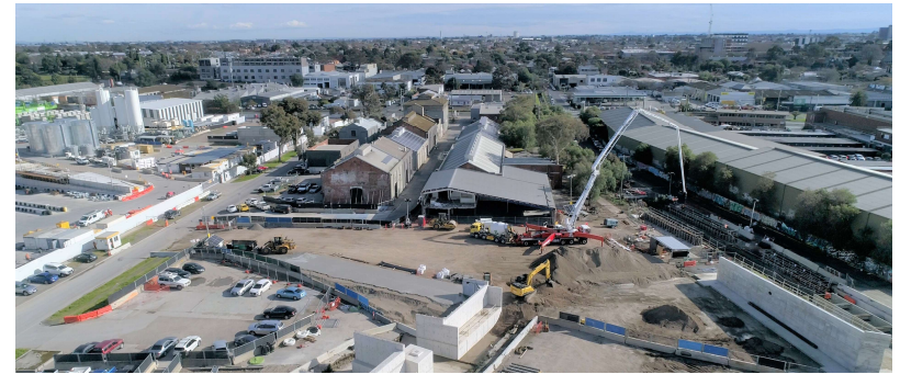
Current aerial image of the Northern Portal site, under construction