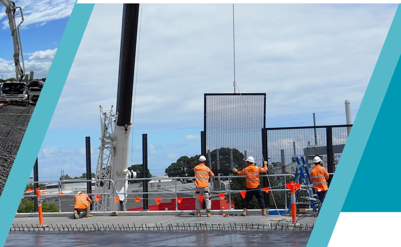
Installing safety screens - Safety screens were installed along the new bridge deck.