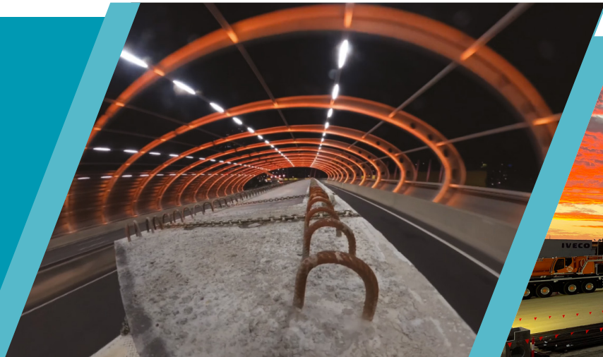
Trucked to site - Beams were made locally in Melton and delivered to site overnight to minimise disruptions to the local community.

Visit @levelcrossings to watch the video about how we did it.