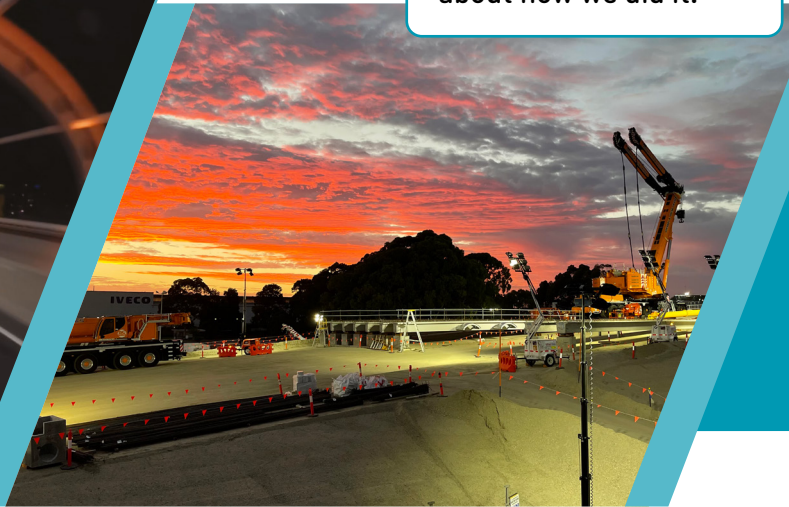
Setting up shop - To do the heavy lifting, we used the 750-tonne crane shared with our team at Greens Road, Dandenong South.