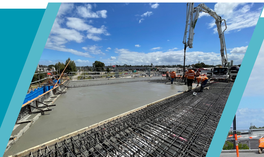
Pouring the bridge deck - 180 cubic metres of concrete was poured to complete the bridge deck.