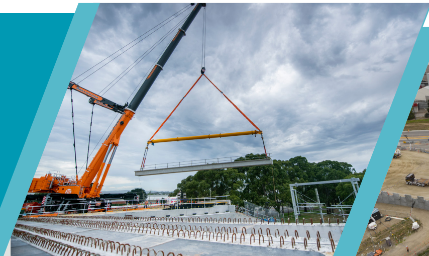
Heavy lifting - It took us nine hours to lift 17 beams into place, weighing 30 tonnes each.