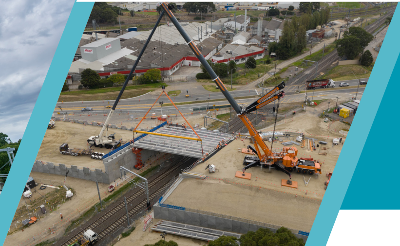
Beaming over Dandenong South - Each beam took around 12 to 17 minutes to install, connecting the new road bridge over the Pakenham line.