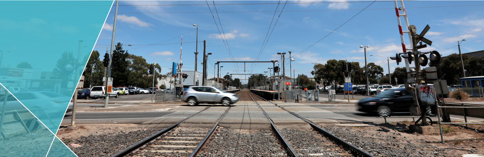
Hallam Road level crossing

The Victorian Government is removing the dangerous level crossing at Hallam Road, Hallam, and building a new station to improve safety, reduce congestion and pave the way for more trains, more often on the Pakenham line.