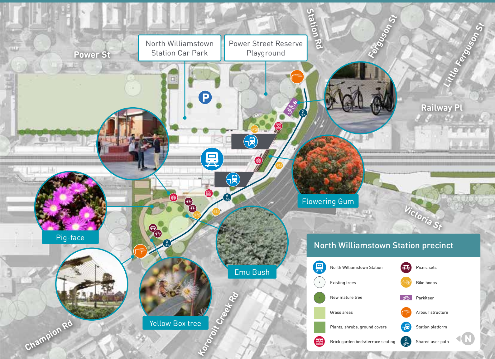
Planting concept designs - subject to change.