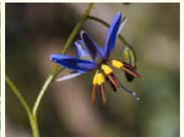
Coastal Flax Lily

We'll also plant a mixture of large trees including: