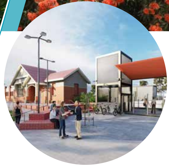
New North Williamstown Station forecourt Artists impression only, subject to change.

We recognise Williamstown's rich heritage and its' importance to the community, and the station's design. The red brick western station building has been meticulously restored and preserved on the city-bound platform. This will be used for Protective Services Officers' facilities and station operations.