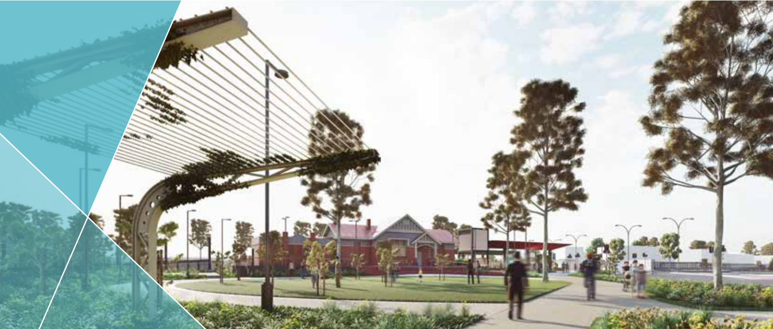
More than 40,000 native plants, trees and shrubs will be planted in the new station precinct. Artist impression, subject to change.