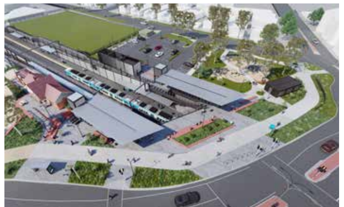
New North Williamstown Station precinct design looking northeast from Victoria Street. Artist impression, subject to change.

Planting and landscaping works will continue into 2022.