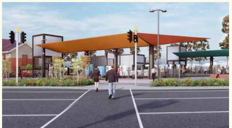
A new signalised crossing will make it easier for pedestrians to access North Williamstown Station, without causing additional delays to drivers. Artist impression, subject to change.

With improved accessibility and security, there will be more ways for pedestrians and cyclists to safely access the station precinct.