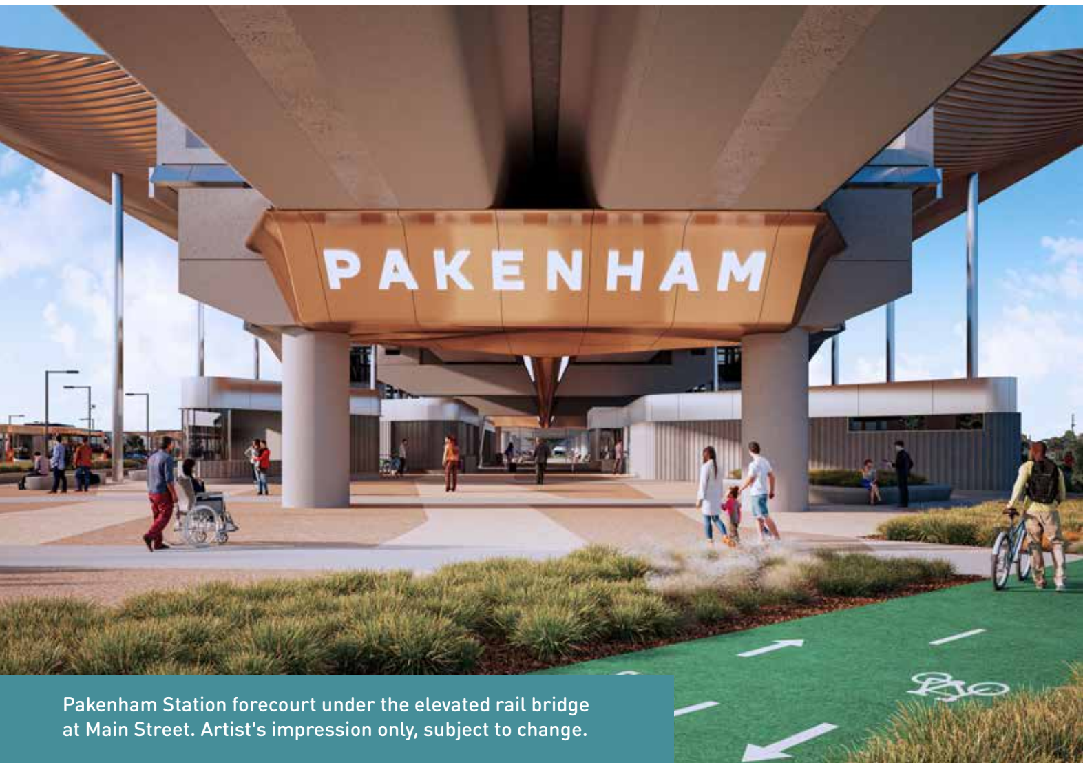
Pakenham Station forecourt under the elevated rail bridge at Main Street. Artist's impression only, subject to change.