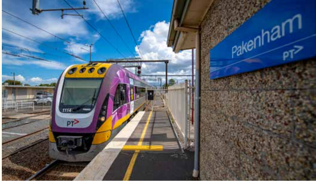
Vline Train stopping at Pakenham Station